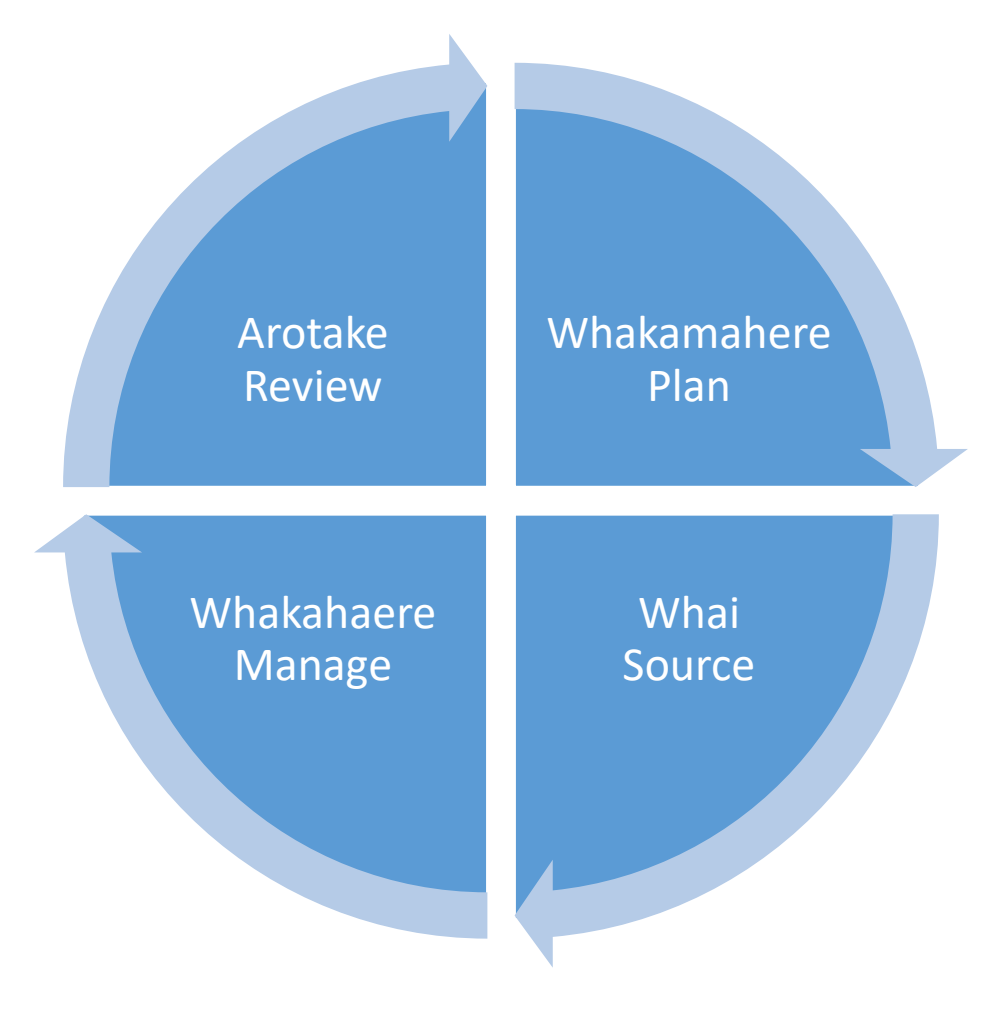
Figure 1 Council Commercial Lifecycle

The appropriate commercial approach and procurement methodology will be based on a number of factors in accordance with the Procedures and will include but is not limited to the risk profile of the commercial activities, the market, the cost and nature of the goods or services requiring to be delivered, and Broader Outcomes.