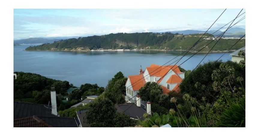
Figure 1 . View from road above 146 Te Anau Road, Hataitai.

of the development from these viewpoints will be high. While the visual character with respect to proposed within the site will change significantly and site amenity will be enhanced overall due the improved pedestrian and cycle access, quality public amenity and site landscaping proposed.