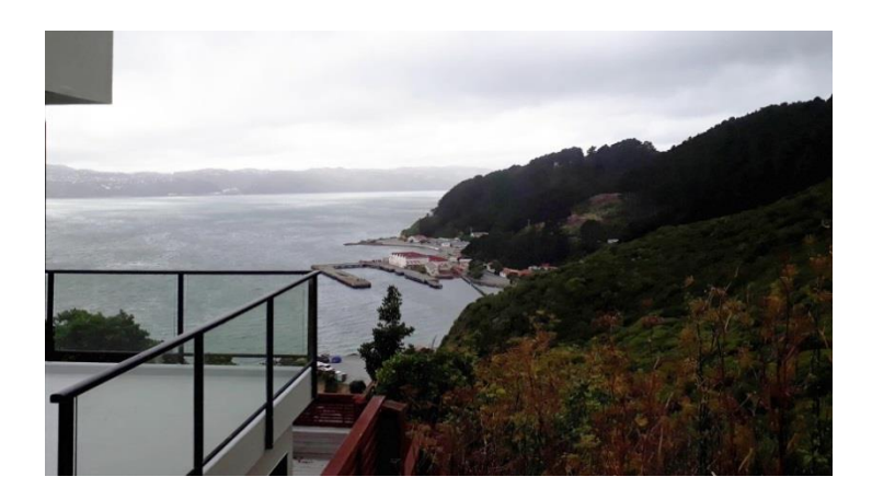
Figure 2. View from 20 Countess Close, Maupuia overlooking Shelly Bay.