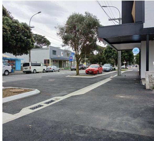
Completed section near Avon Street

At the end of June, we plan to switch our worksite to the western side of The Parade. We will start streetscape upgrades around the Medway Street intersection and progress northwards towards Island Bay Childcare. Medway Street will remain open during these works and the Stop Go operation will continue along The Parade 7:00am – 4:00pm Monday – Friday. We will provide more details of this work closer to starting. See staging plan below for timeframes.