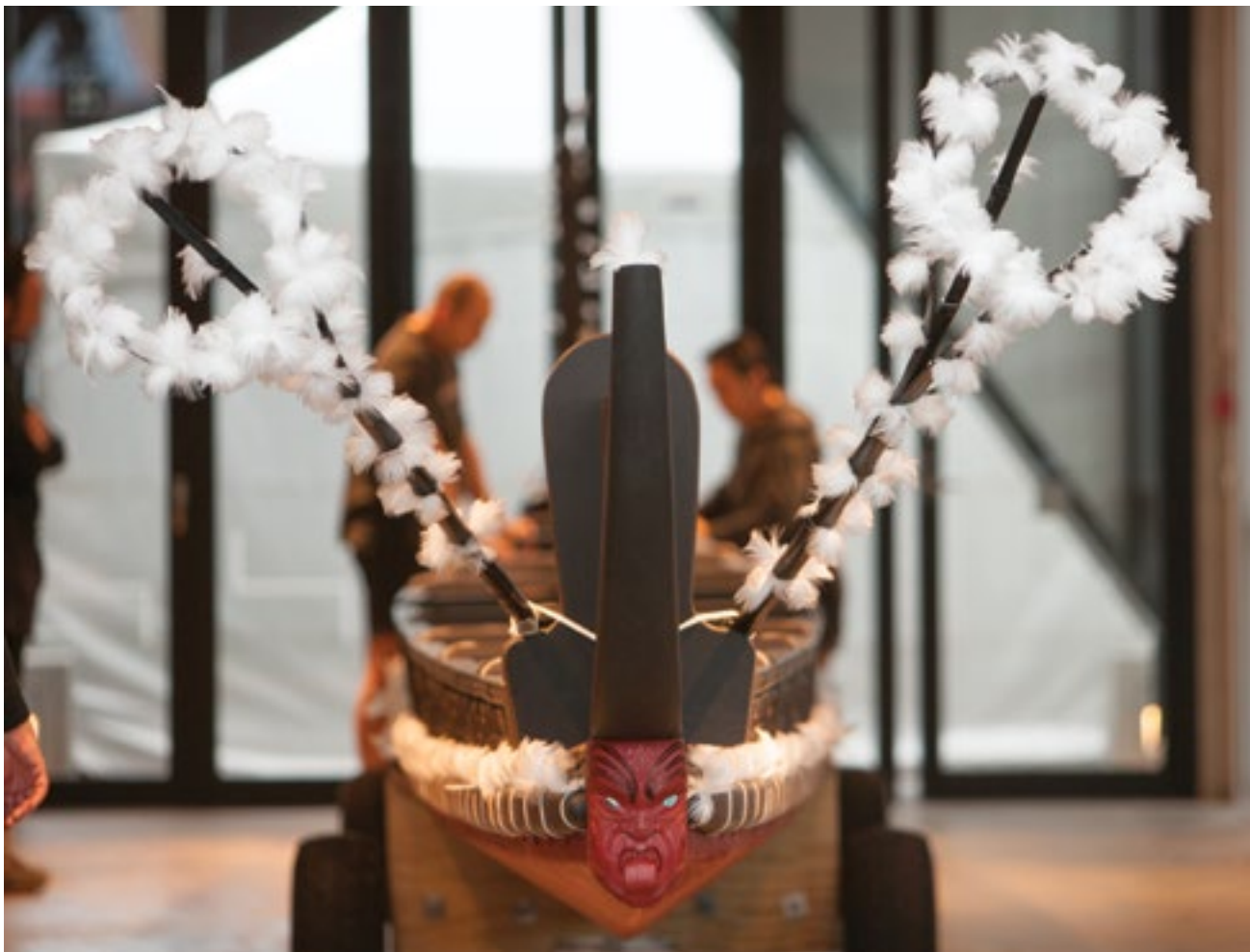
Whakaahua (photo): Te Rerenga Kōtare, waka taua kei Te Raukura te Wharewaka o Pōneke

Te reo Māori can provide that same resilience and strengthen our Council whānau to deliver our organisational objective to actively protect taonga and safeguard Māori cultural concepts, values and practices to be celebrated and enjoyed by all.