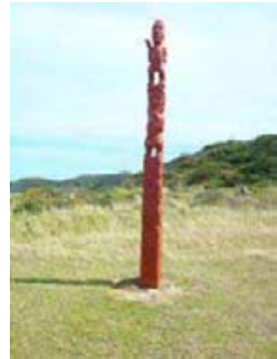
Pou whenua at Oruaiti Pā

When New Zealand Company representative William Wakefield arrived in 1839, Te Atiawa Māori were resident on Motu Kairangi (Miramar Peninsula) but it was not considered one of the main areas of occupation as there were no major Te Atiawa pā or kaingā (villages) there.