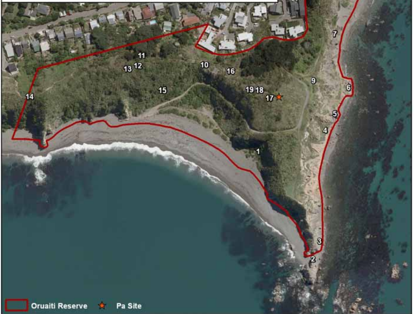
Map C - Oruaiti Reserve Military Structures Based on archaeological survey by Opus - March 2011

Property boundaries: 20m. Contours, road names, rail line, address & title points sourced from Land Information NZ. Crown Copyright reserved. Property boundaries accuracy: +/- 1m in urban areas, +/- 30m in rural areas. Census data sourced from Statistics NZ. Postcodes sourced from NZ Post. Assets, contours, water and drainage information shown is approximate and must not be used for detailed engineering design. Other data has been compiled from a variety of sources and its accuracy may vary, but is generally +/- 1m.