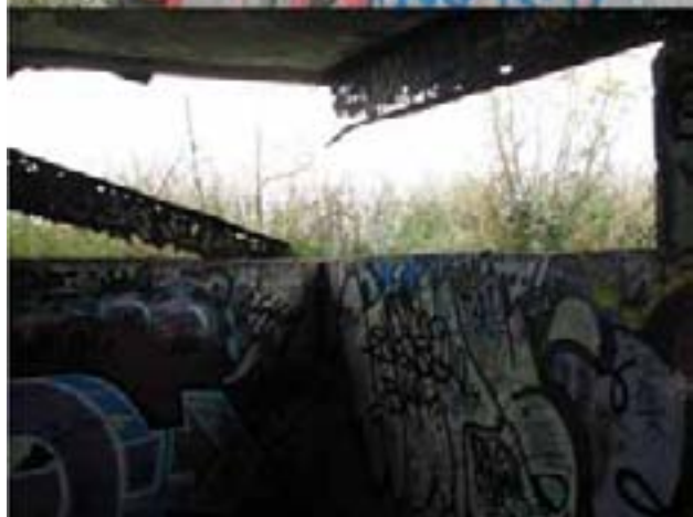
Observation post (OPUS 2011)