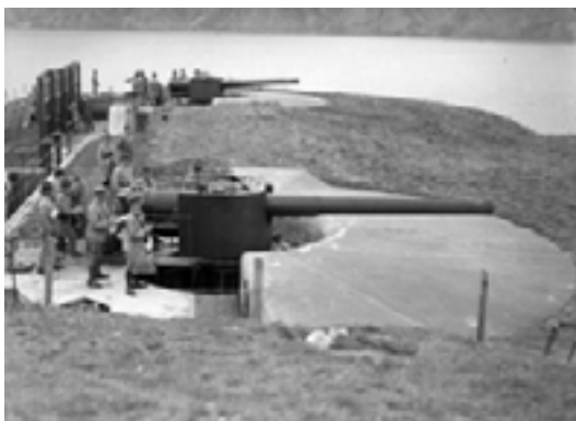
1937 photo of original 6-inch gun emplacements positioned facing south over the harbour entrance.