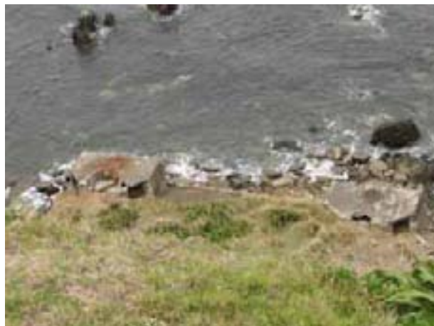
Beach Battery (OPUS 2011)