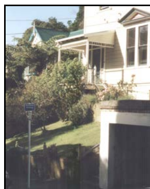
Garage integrated into a front garden

Garages at the street frontage are not common, and multiple garages are rare. Exceptions occur in a few specific locations where garages belong to a continuous wall along the street edge and below and in front of the dwelling. This pattern occurs most notably in Epuni Street and Maarama Crescent but is rare along Aro Street.