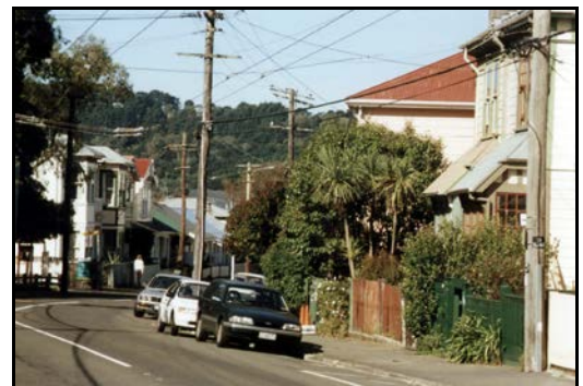
Alignment of frontages to give strong street edge definition