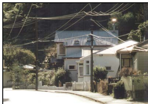
Variation and complexity in Upper Aro Street