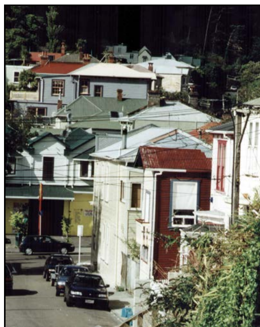
Fine grain, consistency, richness and intricacy

Along central and lower Aro Street and immediate environs, the intensely developed and defined street edge adds further distinctiveness.