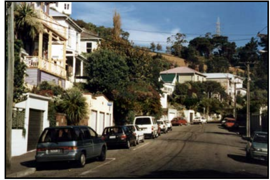
Epuni Street edge