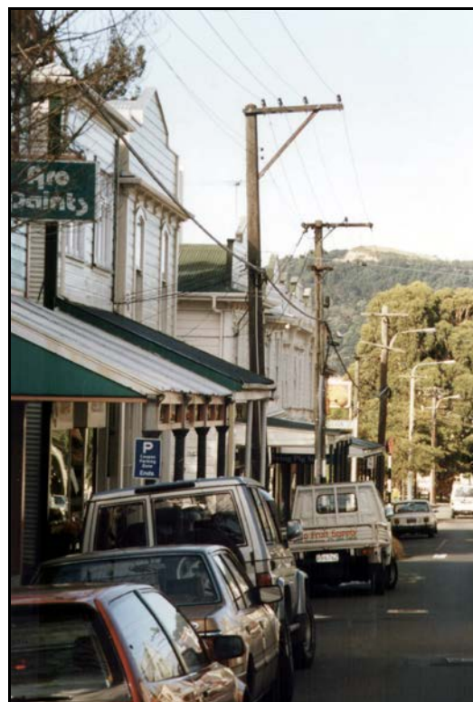
The Aro Valley is a relatively unaltered collection of old buildings

Development began during the nineteenth century. Construction was most intense between 1900 and 1920 when dwellings began to spread up into the hills above Aro Street. Around half of the buildings in the Aro Valley date from this period, and while these are spread throughout, concentrations