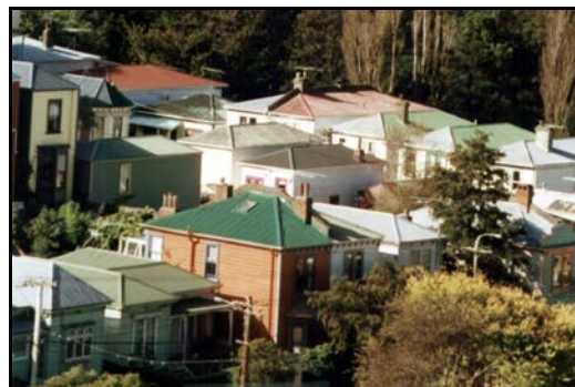
Cluster development roofscape suggested

Row house or apartment development is not common. Row housing, particularly at a right angle to the street, as well as stepped/cascading form of development would contrast and be uncharacteristic. However, the concentration and orthogonal alignment of individual dwellings on separate small lots located very closely to each other on the flatter parts of the area suggests a form of cluster development.