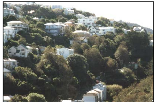
Dominance of planting on steep sites