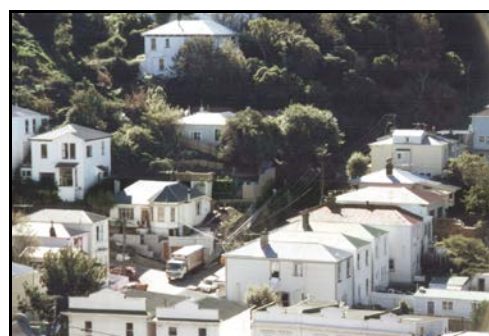
High intensity development along the street edge and at the centre of the valley

Flat sites at the centre of Aro Street have relatively high site coverage. This reinforces the effect of concentration and intensity along the street edge and is complemented by relatively low site coverage on the steeply sloping valley sides. At the sides of the valley, rear yards are often heavily planted, giving the effect of a garden setting for the area as a whole.