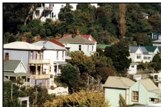
Typically intricate roofscape, demonstrating consistencies of roof type and pitch

Distinctive combinations of type and pitch are evident. Hips are typically moderately pitched, and gables steep and typically narrow span. Moderately pitched gabled roofs are uncharacteristic and the steep hipped roof is virtually absent.