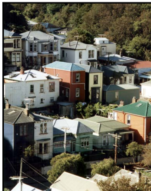
Limited variability of building frontage widths

Patterns of relatively narrow frontages in a consistent range of widths can be found. Along the central valley and valley floor areas, buildings share a limited range of frontage widths. Maarama Crescent has notably large dwellings, typically 10-12m wide. While dwelling widths though the remainder of the area are variable, concentrations of dwellings 5-6 and 8-9 metres wide are common. These buildings are typically found fronting Epuni, Aro and lower Devon Streets.