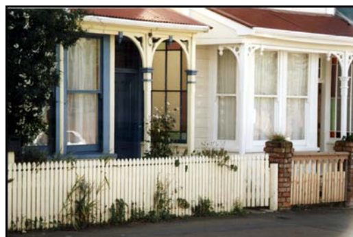
Entrances and main windows addressing the street

Front elevations, always including main windows and usually entrances as well, are consistently oriented towards the street. Characteristic of their era of construction, these front elevations have strongly articulated surfaces with three-dimensional construction detail. Decorative elements are often used, particularly on villas and larger buildings. Bay windows, porches and verandas are common at frontages.