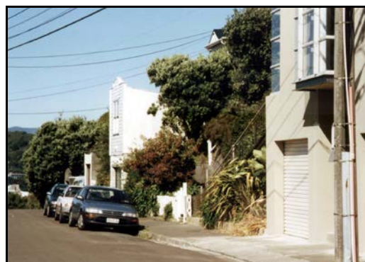
Setbacks and diversity of street edge treatment in Maarama Crescent, including ancillary buildings