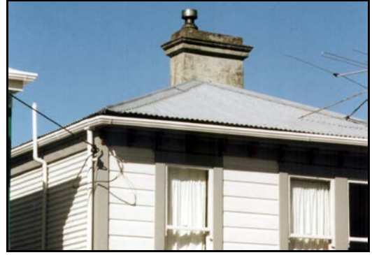
Combination of characteristic materials

Modular cladding materials - such as the rusticated weatherboard used on frontages and horizontal corrugated iron on the sides of buildings - give visual texture and richness.