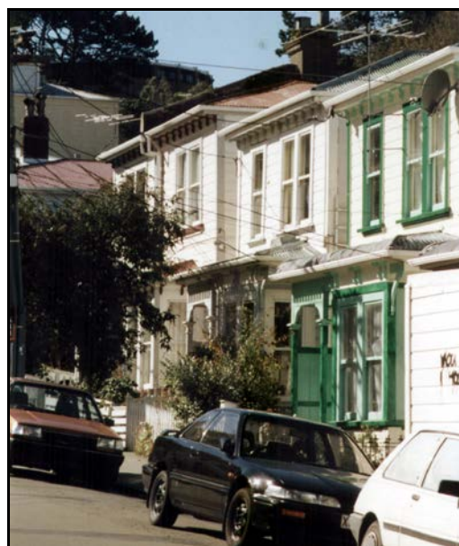
Shallow front gardens and strong street edge definition

These contrast with central and lower Aro Street and its immediate environs due to their greater diversity and complexity, and in places, greater variability in setbacks from boundaries. Nevertheless, the type and scale of primary building forms, roof forms, materials and textures remain generally consistent.