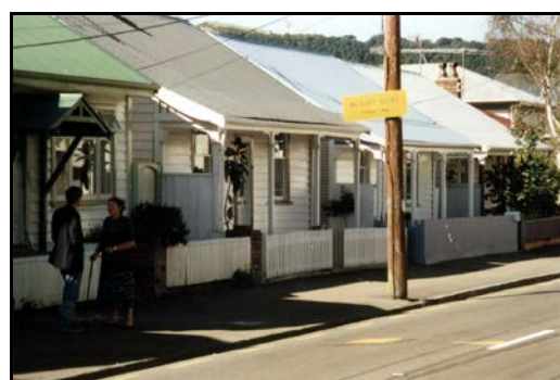
Neighbouring buildings, close to frontages and aligned with each other give strong definition to the street edge.

Frontage setbacks typically follow one of two patterns. They are generally shallow, often in the range of 0-2m on flat sites or when the site slopes steeply down from the street. When a site slopes up from the street, setbacks increase dramatically, commonly to around 5m, and up to 10m.