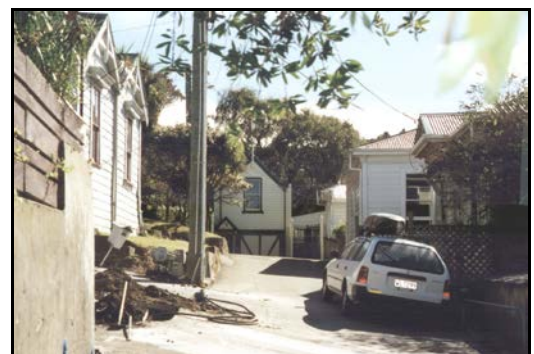
Variability in rear sites off Aro Street