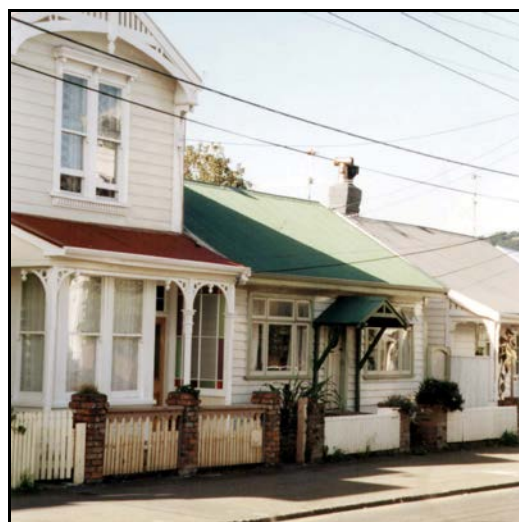
Consistency and variation of building height co-exist

Greatest variability in building size is found in parts of the area characterised by rear sites (eg Boston Terrace and other rear sites off and to the south of Aro Street, Levina Avenue) and steeply sloping topography (eg Upper Abel Smith Street and upper Devon Street).