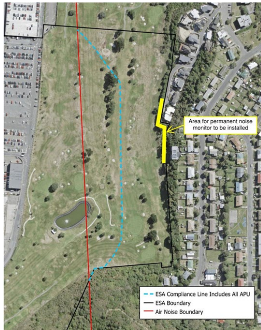
Figure 6—NOISE: East Side Precinct Compliance Line and Noise Monitoring