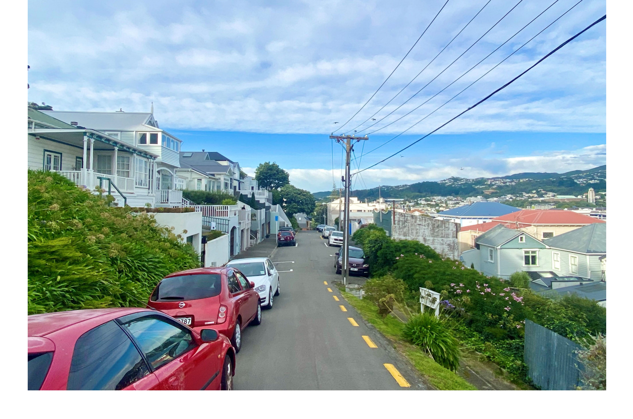
Very narrow Earl's Terrace, 17<sup>th</sup> steepest street in Wellington