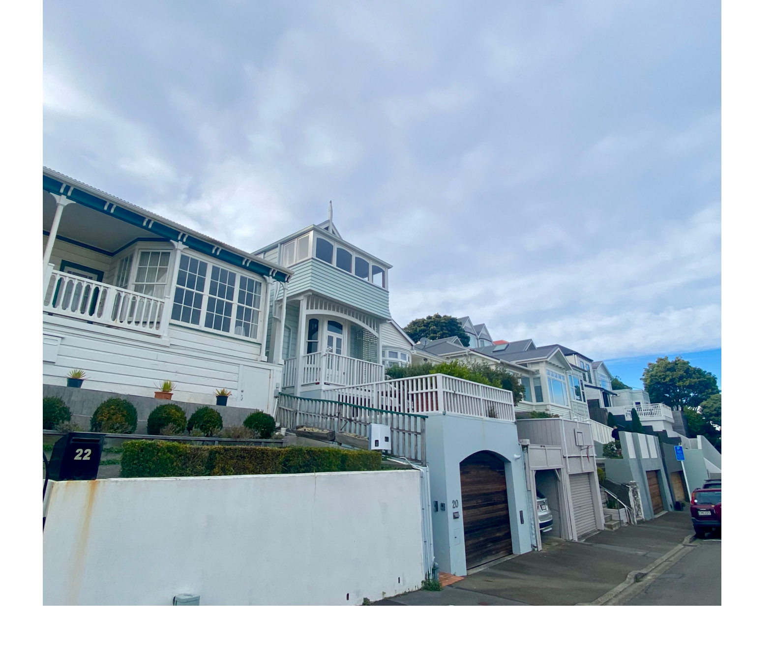
Earl's Terrace consists largely of original houses built in the C19