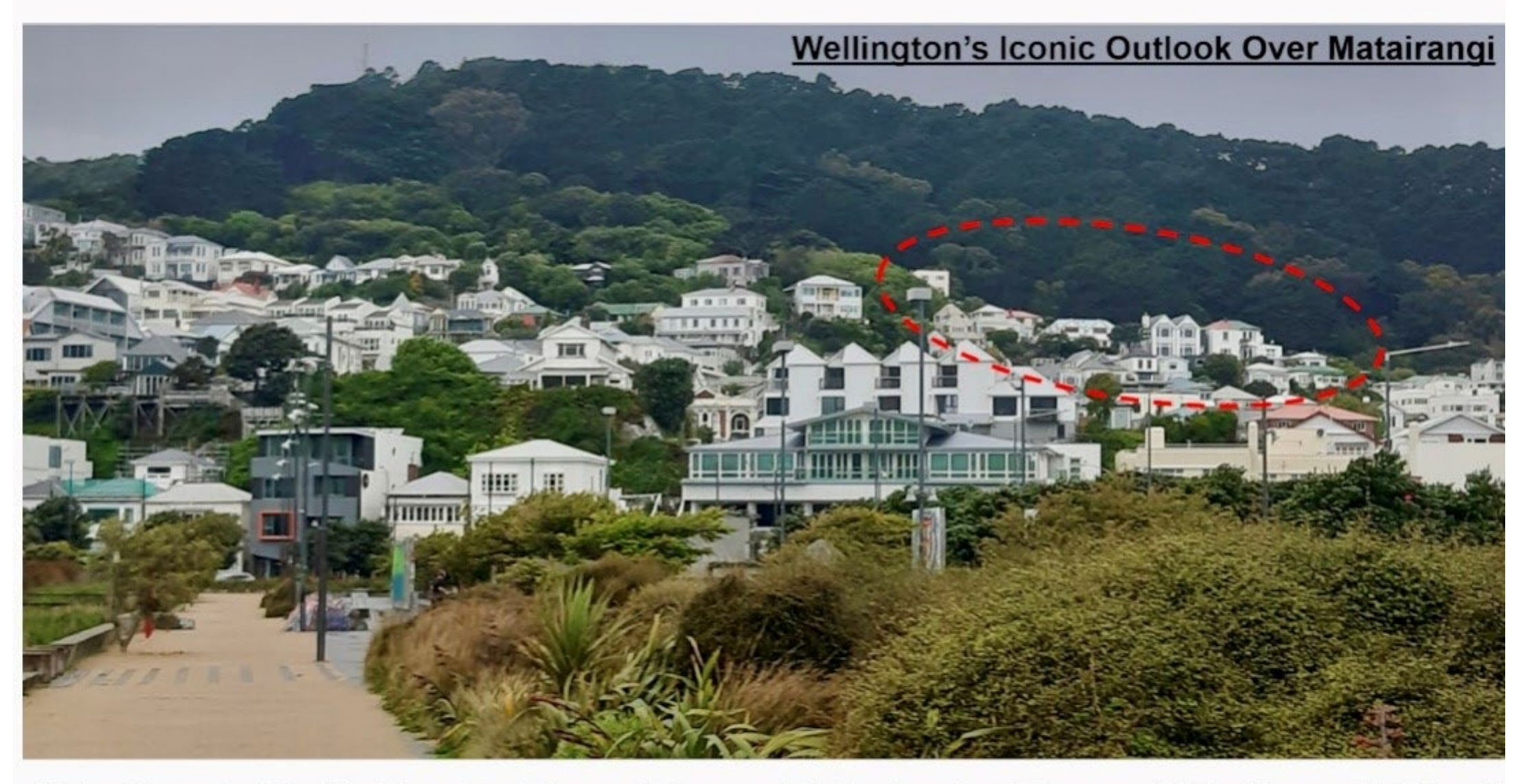
Stafford St & Earls Tce, Mount Victoria From Waitangi Park