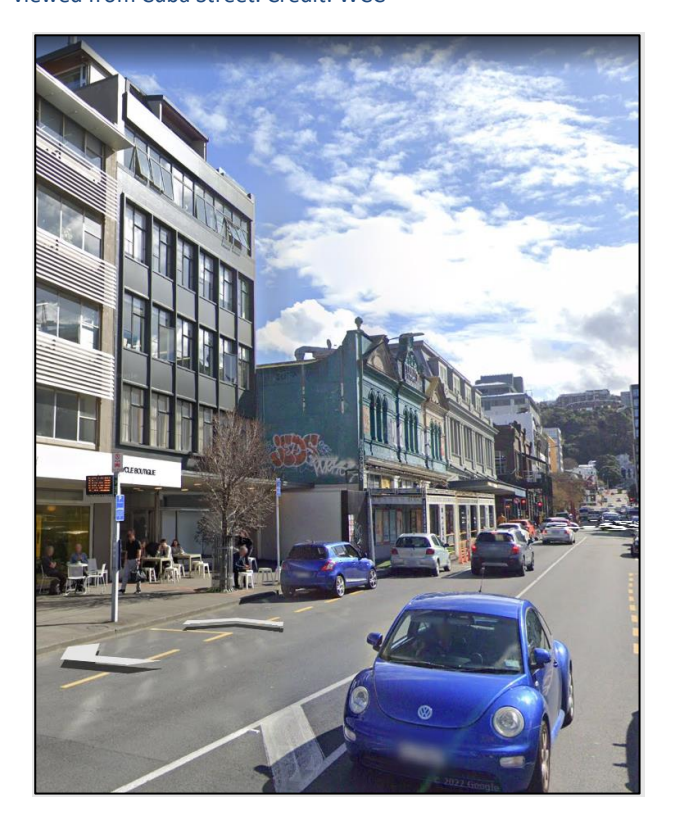
Figure 5: View of 39 (6 storey) and 43 Ghuznee Street (blue building) showing effect of different lot boundaries