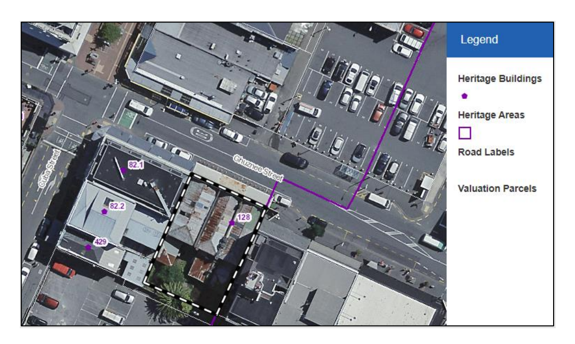
Figure 1: PDP screenshot of historic heritage overlays applying to 43 Ghuznee Street