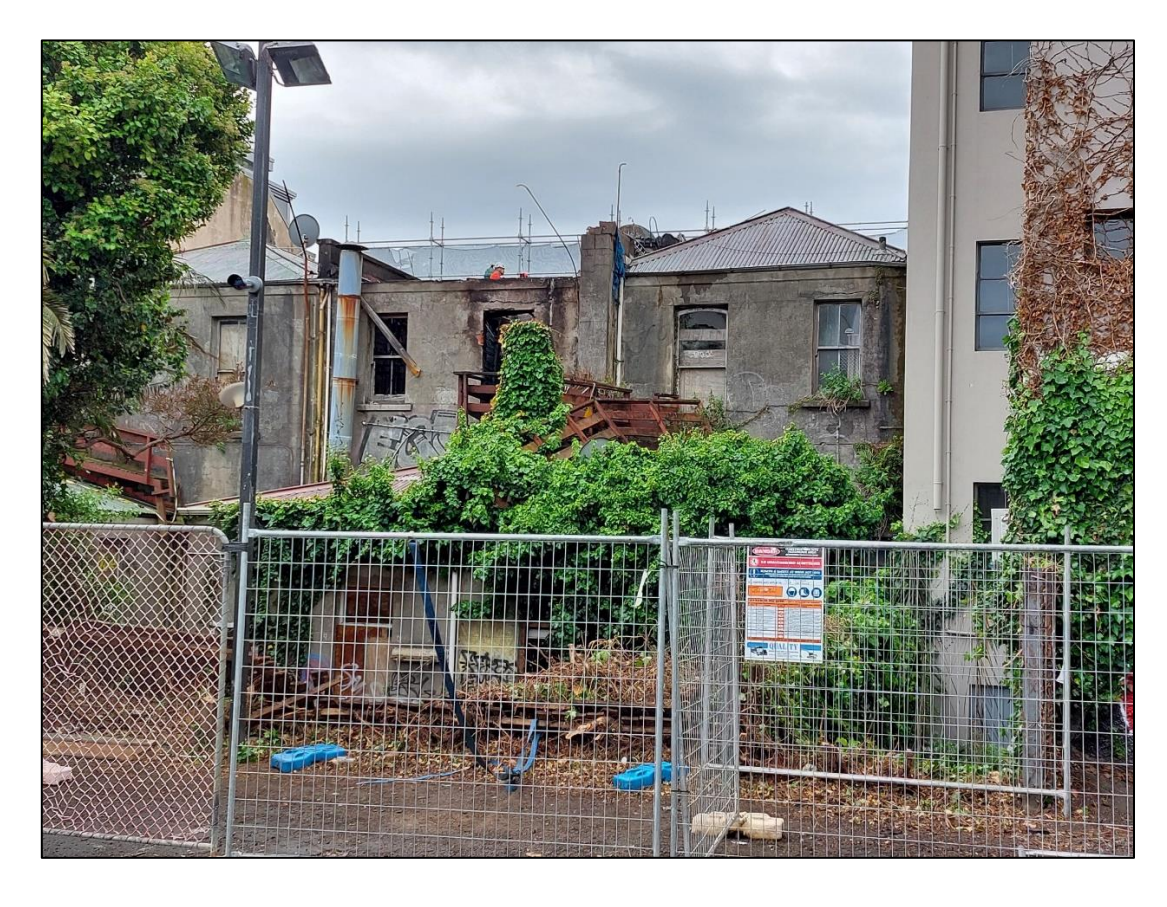
Figure 3: Image of demolition works looking north from Swan Lane