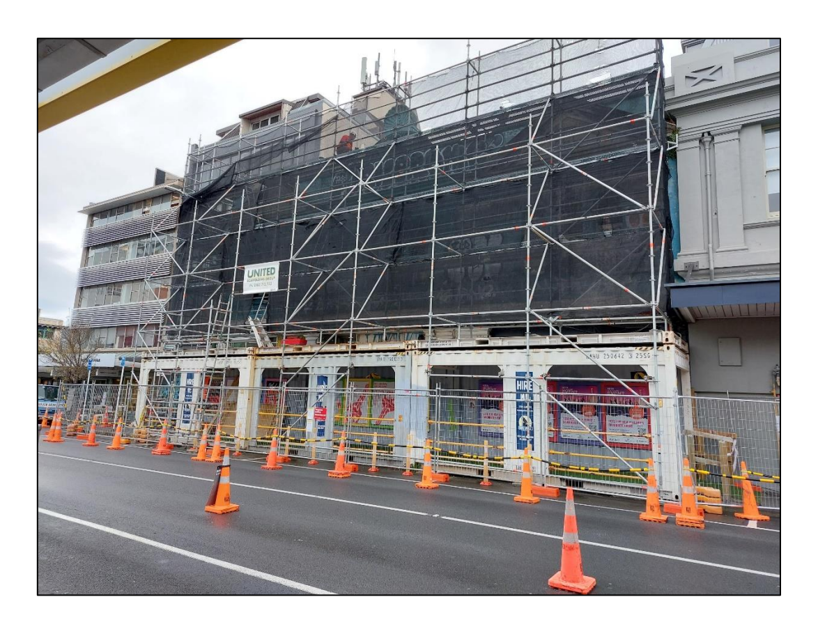
Figure 2: Image of demolition works looking south from Ghuznee Street