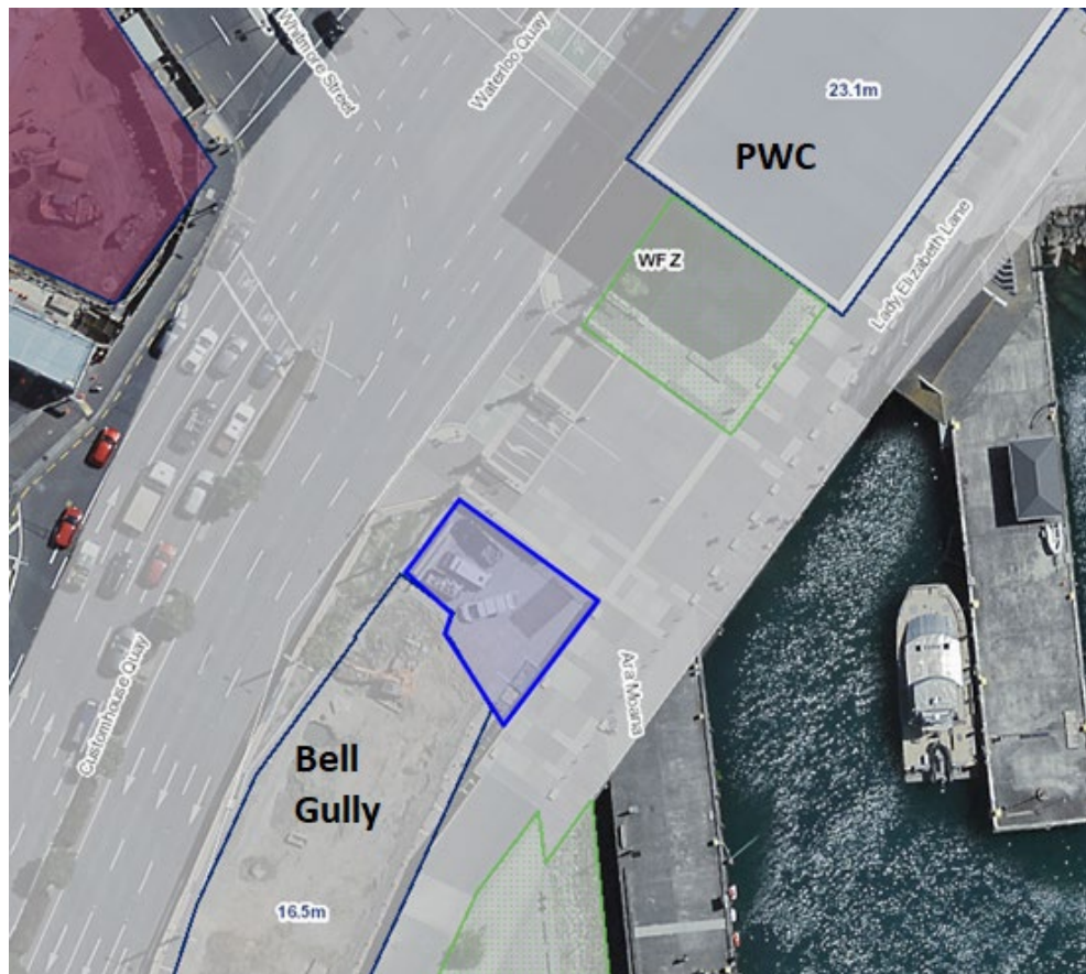
Figure 1: New Waterfront Public Open Space specific control north of Bell Gully building