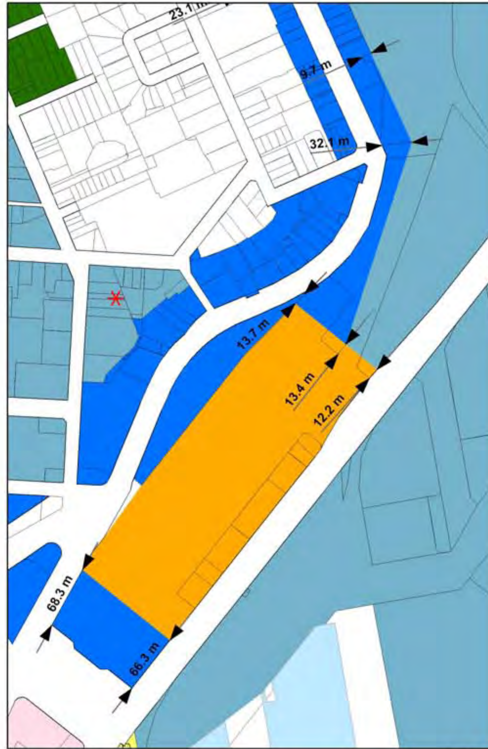
Thorndon Quay 1:4,000