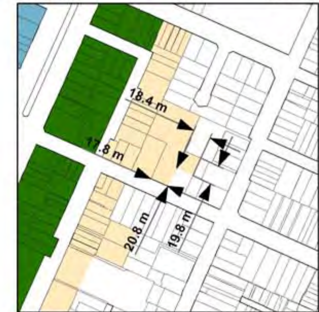
Kent Terrace 1:4,000