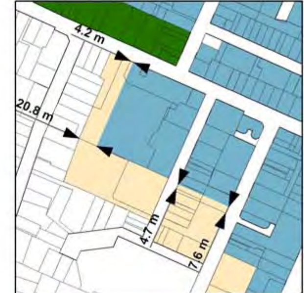
Webb St 1:4,000