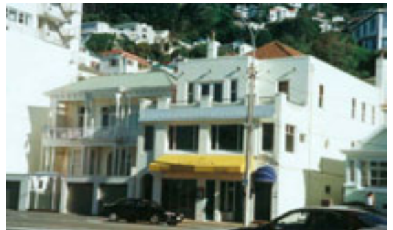
Predominance of light exterior colours, variety of external materials

Buildings along Oriental Parade use a variety of external materials ranging from weatherboard cladding and corrugated iron to concrete, plaster finish and roof tiles. Despite the variety of cladding materials, the area as a whole is characterised by predominantly light exterior colours.