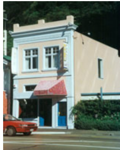
Ground level activities that support the public use of the area