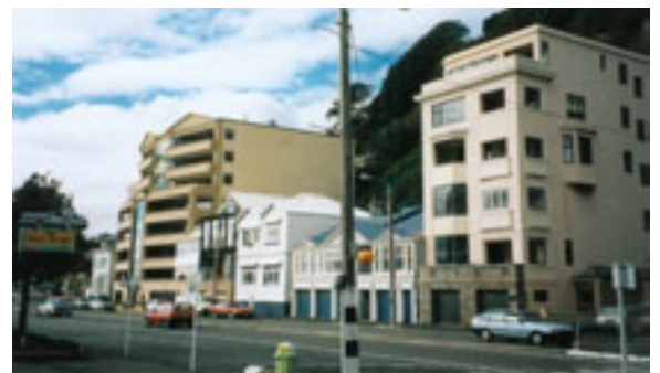
Mix of old and new, tall and low buildings