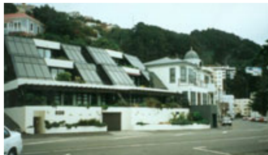
“Stepped” building form is not typical of the area

The detailed treatment of street elevations is important as it adds visual interest and enhances the quality of the street. This is