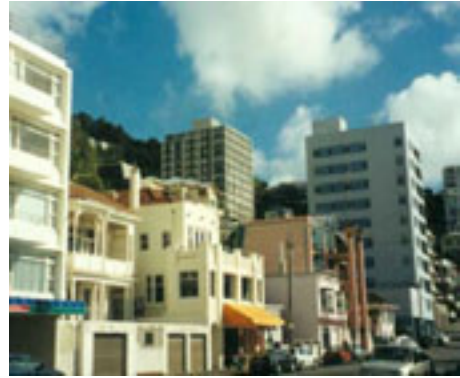
Side elevations visible from the street

The height differences between adjacent buildings along Oriental Parade make their side elevations or parts of them visible from the street. Beyond the range of the street, buildings or parts of them can be seen in relation to each other from the interiors of other buildings or from neighbouring public spaces. The expressive topography of the wider Oriental Bay area provides multiple opportunities for viewing the backs, sides and tops of the Oriental Parade buildings. In this sense all building elevations that can be seen from public spaces or have a direct visual relationship to the street or adjacent buildings, deserve careful design treatment.