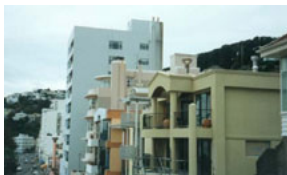
Multi-storey apartment blocks - a recurring building type

Oriental Parade provides opportunities for high density residential development, which often occurs on amalgamated sites. As a result, the building bulk of new development can be visually dominating, especially where the combination of the height, length and/or width of the proposed building is significantly greater than that of its built surroundings.