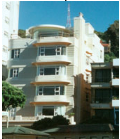
Façade features and detail on side elevations