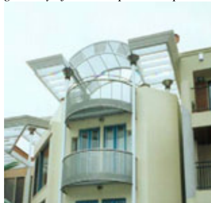
Distinctive building top adds interest to the skyline