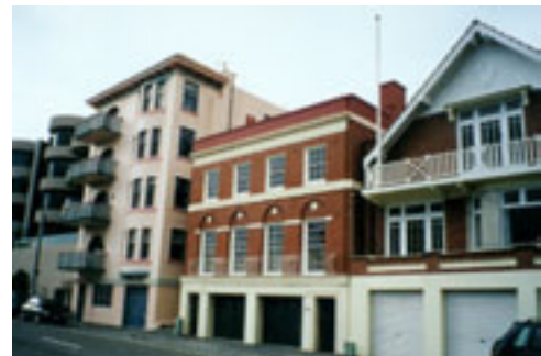
Relationship to heritage buildings is an important design consideration