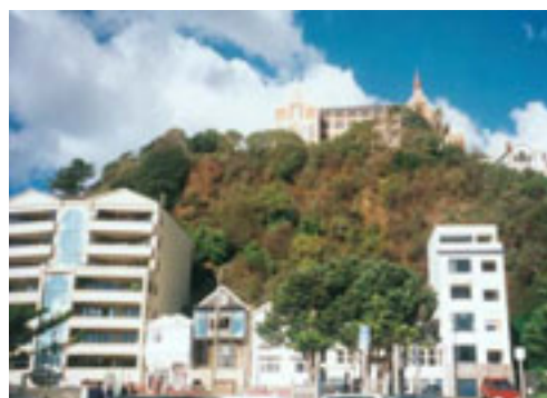
Building tops that project directly against the greenery of the escarpment - a particular concern