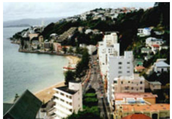
Oriental Parade - a visually prominent area with strong identity