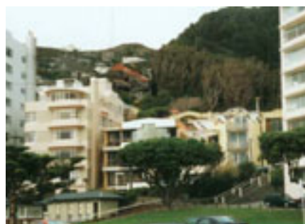
Diversity and visual complexity