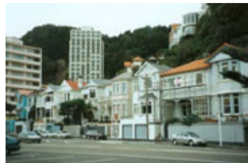
188-200 Oriental Parade - a notable collection of listed heritage buildings with consistent age, form and scale

Oriental Parade has a linear form, constrained by the adjacent hills and a general lack of flat land. The structure of the area is characterised by long narrow blocks and a limited number of cross streets.