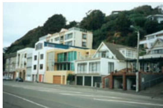
A strongly defined street edge

Oriental Parade buildings present a positive “public face” to the street. Balconies, bay windows and pedestrian entrances are common features of existing building frontages.