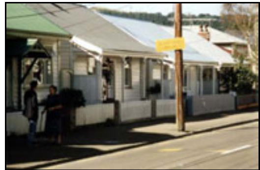
Neighbouring buildings, close to frontages and aligned with each other give strong definition to the street edge.

Frontage setbacks typically follow one of two patterns. They are generally shallow, often in the range of 0-2m on flat sites or when the site slopes steeply down from the street. When a site slopes up from the street, setbacks increase dramatically, commonly to around 5m, and up to 10m.