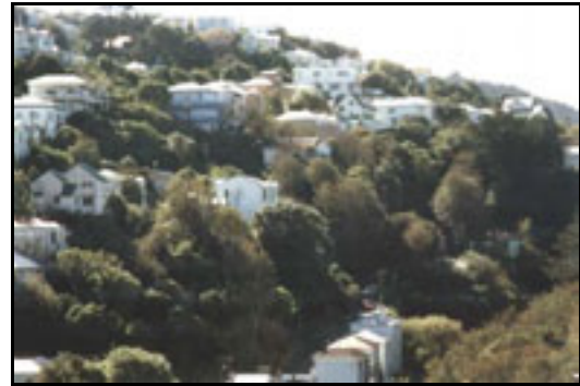
Dominance of planting on steep sites