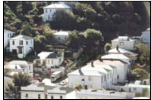
High intensity development along the street edge and at the centre of the valley

Flat sites at the centre of Aro Street have relatively high site coverage. This reinforces the effect of concentration and intensity along the street edge and is complemented by relatively low site coverage on the steeply sloping valley sides. At the sides of the valley, rear yards are often heavily planted, giving the effect of a garden setting for the area as a whole.