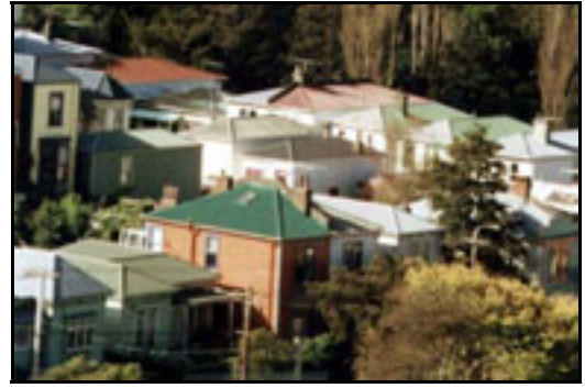
Cluster development roofscape suggested

Row house or apartment development is not common. Row housing, particularly at a right angle to the street, as well as stepped/cascading form of development would contrast and be uncharacteristic. However, the concentration and orthogonal alignment of individual dwellings on separate small lots located very closely to each other on the flatter parts of the area suggests a form of cluster development.