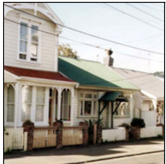
Consistency and variation of building height co-exist

Greatest variability in building size is found in parts of the area characterised by rear sites (eg Boston Terrace and other rear sites off and to the south of Aro Street, Levina Avenue) and steeply sloping topography (eg Upper Abel Smith Street and upper Devon Street).