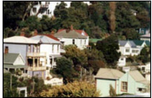
Typically intricate roofscape, demonstrating consistencies of roof type and pitch

Distinctive combinations of type and pitch are evident. Hips are typically moderately pitched, and gables steep and typically narrow span. Moderately pitched gabled roofs are uncharacteristic and the steep hipped roof is virtually absent.