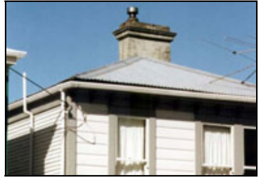
Combination of characteristic materials