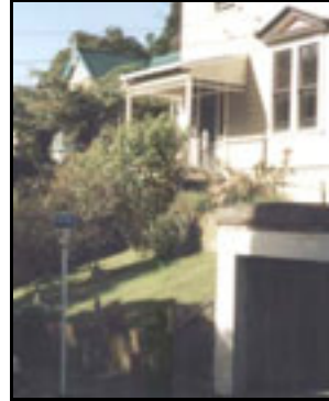
Garage integrated into a front garden

Garages at the street frontage are not common, and multiple garages are rare. Exceptions occur in a few specific locations where garages belong to a continuous wall along the street edge and below and in front of the dwelling. This pattern occurs most notably in Epuni Street and Maarama Crescent but is rare along Aro Street.