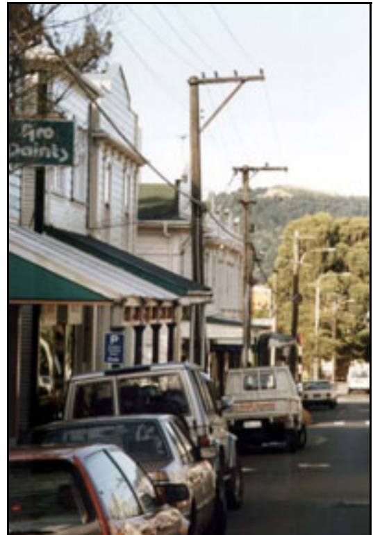
The Aro Valley is a relatively unaltered collection of old buildings