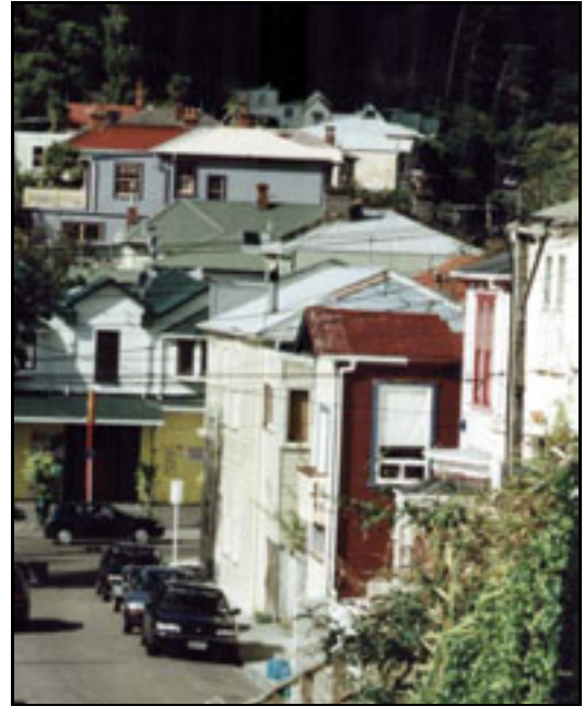
Fine grain, consistency, richness and intricacy

Along central and lower Aro Street and immediate environs, the intensely developed and defined street edge adds further distinctiveness.