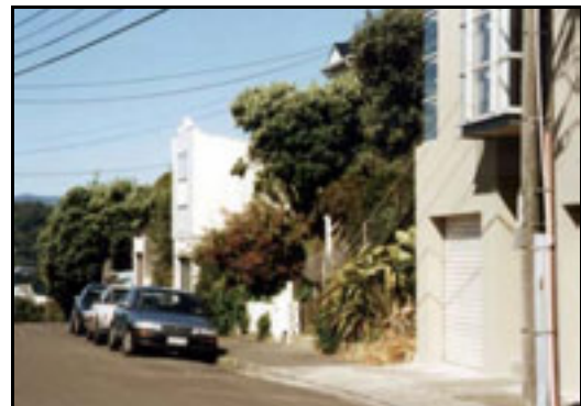
Setbacks and diversity of street edge treatment in Maarama Crescent, including ancillary buildings