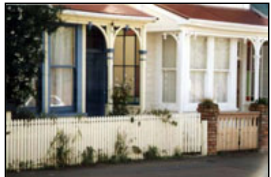
Entrances and main windows addressing the street

Front elevations, always including main windows and usually entrances as well, are consistently oriented towards the street. Characteristic of their era of construction, these front elevations have strongly articulated surfaces with three-dimensional construction detail. Decorative elements are often used, particularly on villas and larger buildings. Bay windows, porches and verandas are common at frontages.