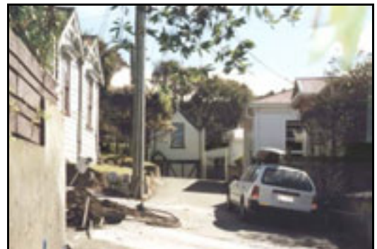
Variability in rear sites off Aro Street