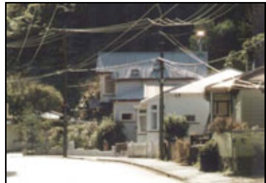
Variation and complexity in Upper Aro Street