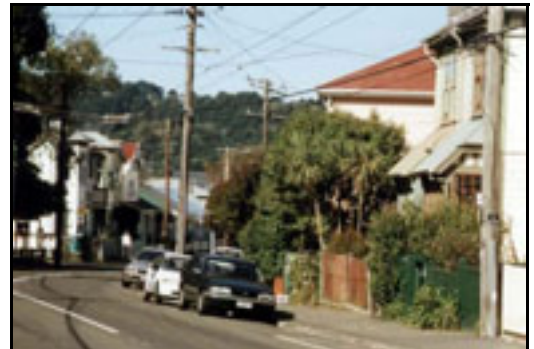
Alignment of frontages to give strong street edge definition