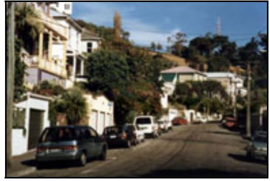
Epuni Street edge