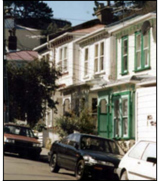
Shallow front gardens and strong street edge definition

These contrast with central and lower Aro Street and its immediate environs due to their greater diversity and complexity, and in places, greater variability in setbacks from boundaries. Nevertheless, the type and scale of primary building forms, roof forms, materials and textures remain generally consistent.