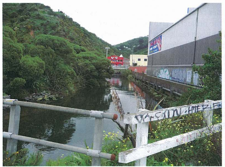
Fig 3: Site photos

Ownership of land in the Kaiwharawhara area is complex and fragmented and would need to be resolved as part of the study. This has been exacerbated by land transfer which has not been officially gazetted, formally documented, legal technicalities around transfer of reclaimed land, and errors in transfer of titles. Centreport has title to a large portion of the reclamation but Department of Conservation (DoC), Transport Agency (NZTA), and the Crown also appear to own land within the site area.