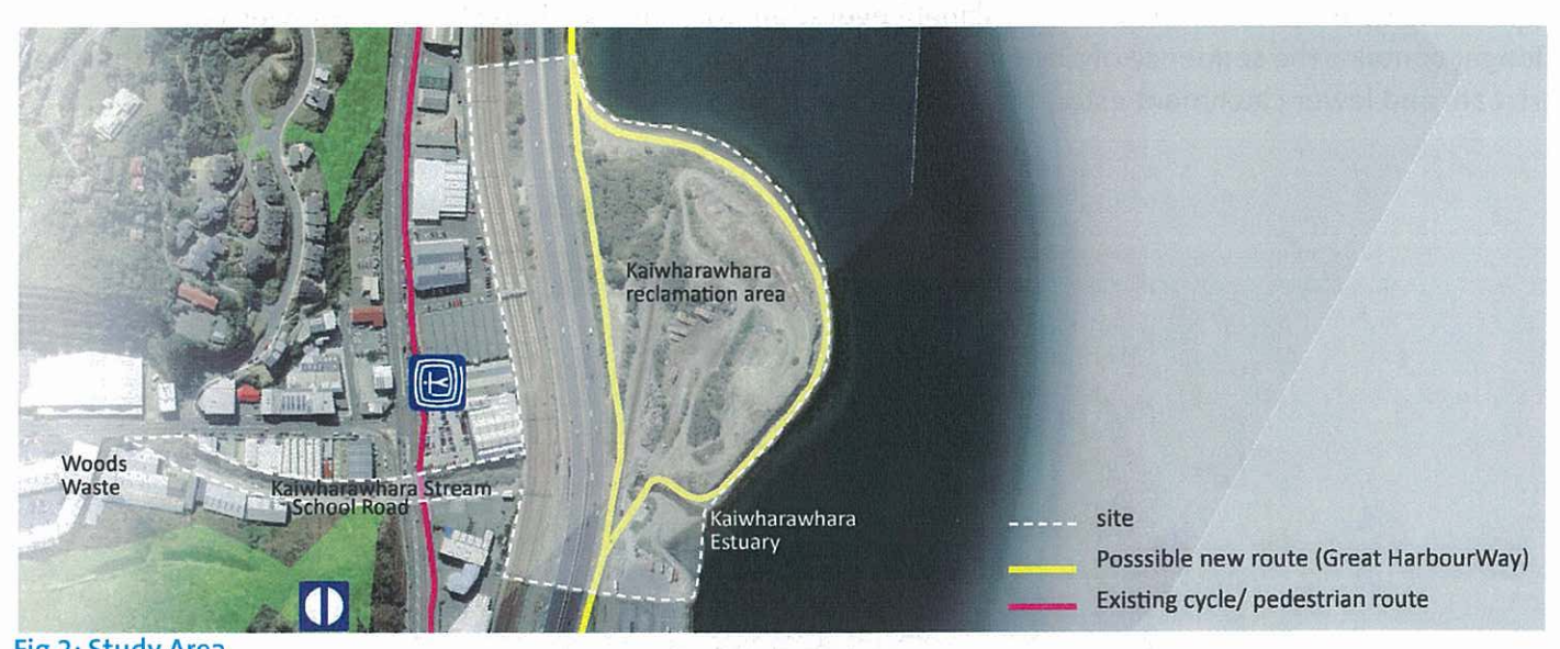
Fig 2: Study Area Adapted from the Great harbour Way Issues & Opportunities Report, 2009

After considering how the site fits within the Kaiwharawhara catchment, the study would focus on issues and opportunities centred about the estuary mouth and reclamation. It would encompass the reclamation area, the estuary and stream environs affected by tidal influences. During a spring tide, this would include the area from the estuary mouth up as far as 'Woods Waste Disposal site, on School Road (see Figure 2).