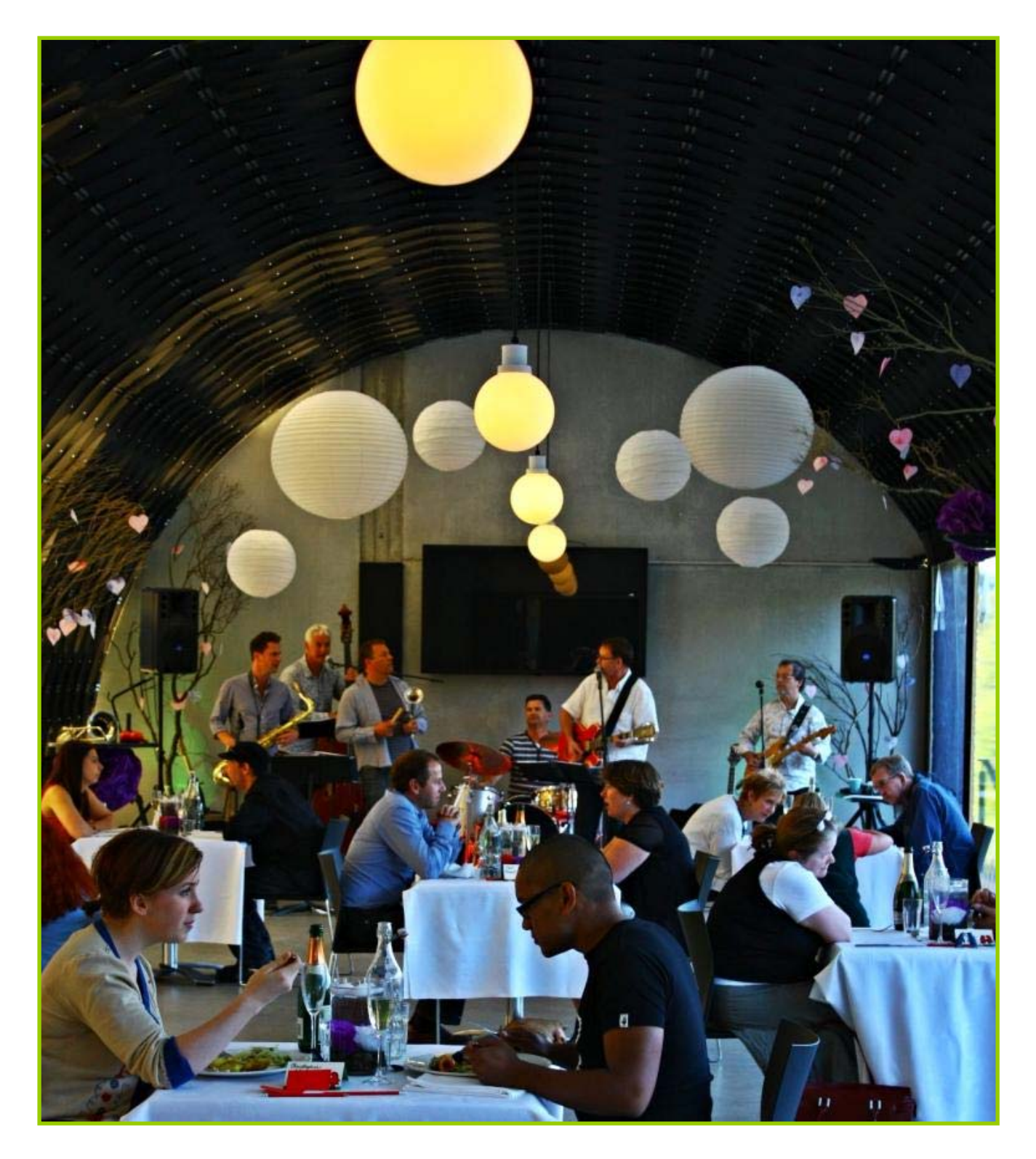
Visitors enjoy a gourmet dinner and music in Kamala's on Valentine's Night