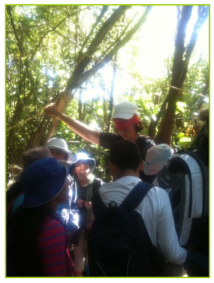
Bush Builders children on a nature trail