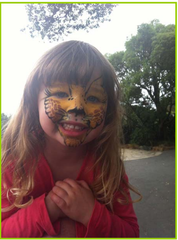
Beautiful face painting at Children's Day