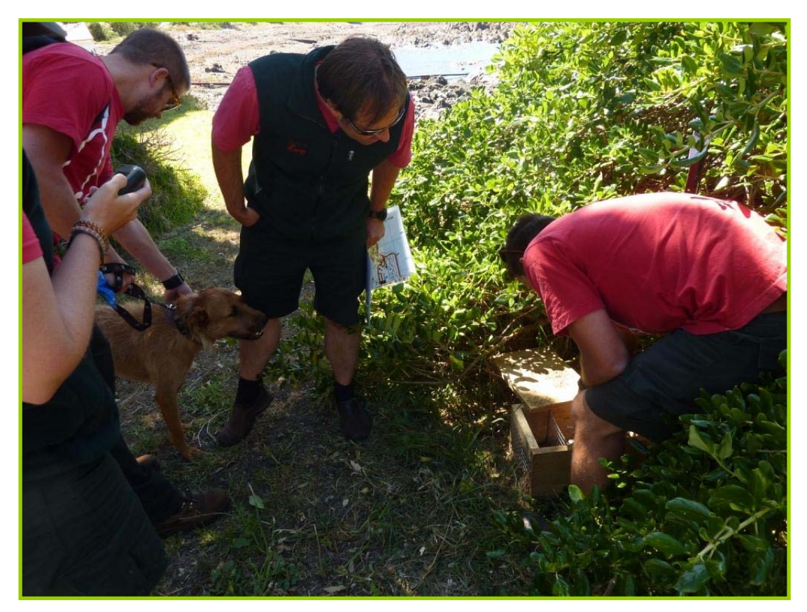
Zoo staff checking pest traps on the south coast.