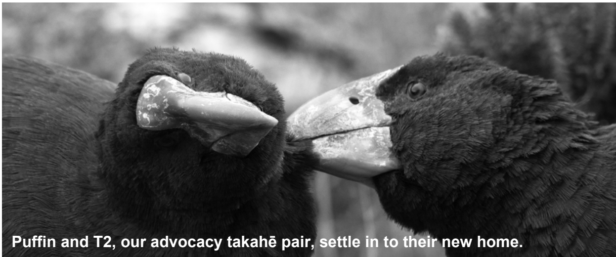
Puffin and T2, our advocacy takahē pair, settle in to their new home.