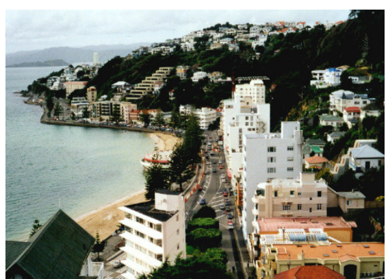
Oriental Parade - a visually prominent area with strong identity