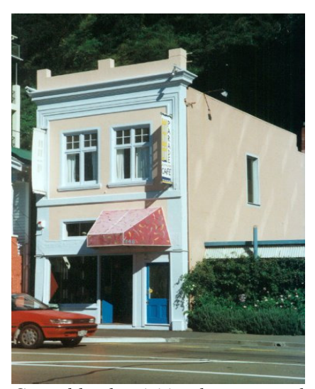
Ground level activities that support the public use of the area