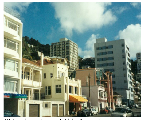
Side elevations visible from the street

The height differences between adjacent buildings along Oriental Parade make their side elevations or parts of them visible from the street. Beyond the range of the street, buildings or parts of them can be seen in relation to each other from the interiors of other buildings or from neighbouring public spaces. The expressive topography of the wider Oriental Bay area provides multiple opportunities for viewing the backs, sides and tops of the Oriental Parade buildings. In this sense all building elevations that can be seen from public spaces or have a direct visual relationship to the street or adjacent buildings, deserve careful design treatment.