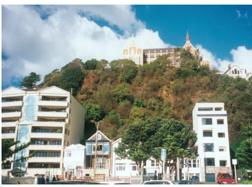
Building tops that project directly against the greenery of the escarpment - a particular concern