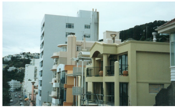
Multi-storey apartment blocks - a recurring building type

Oriental Parade provides opportunities for high density residential development, which often occurs on amalgamated sites. As a result, the building bulk of new development can be visually dominating, especially where the combination of the height, length and/or width of the proposed building is significantly greater than that of its built surroundings.