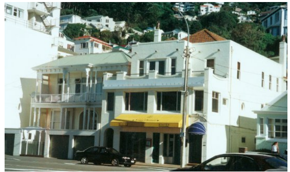
Predominance of light exterior colours, variety of external materials

Buildings along Oriental Parade use a variety of external materials ranging from weatherboard cladding and corrugated iron to concrete, plaster finish and roof tiles. Despite the variety of cladding materials, the area as a whole is characterised by predominantly light exterior colours.