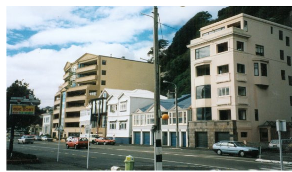
Mix of old and new, tall and low buildings