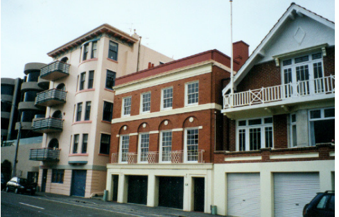
Relationship to heritage buildings is an important design consideration