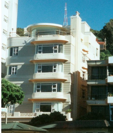
Façade features and detail on side elevations