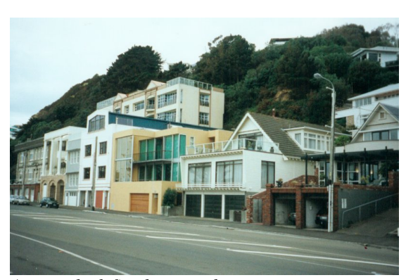
A strongly defined street edge

Oriental Parade buildings present a positive "public face" to the street. Balconies, bay windows and pedestrian entrances are common features of existing building frontages.