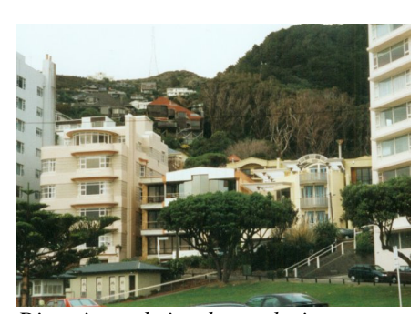
Diversity and visual complexity

The detailed treatment of street elevations is important as it adds visual interest and enhances the quality of the street. This is