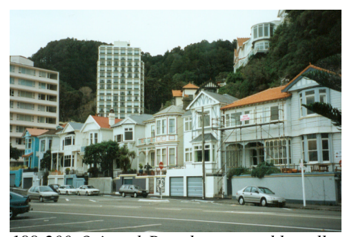
188-200 Oriental Parade - a notable collection of listed heritage buildings with consistent age, form and scale

Oriental Parade has a linear form, constrained by the adjacent hills and a general lack of flat land. The structure of the area is characterised by long narrow blocks and a limited number of cross streets.