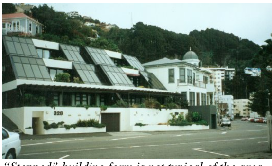
"Stepped" building form is not typical of the area

The design of the tops of taller buildings needs particular consideration to ensure they contribute to a strong and distinctive silhouette line.