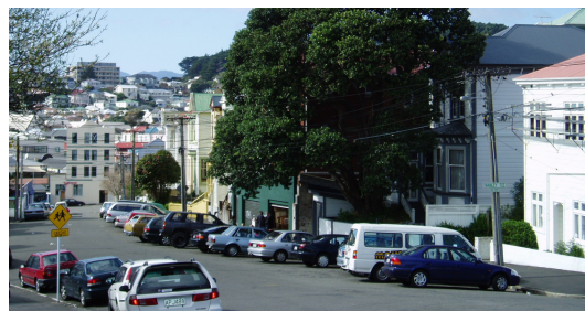
Carparking is typically on the street

Most of the existing garages are found along the higher side of streets. Garages on steep frontages, typically built into the slope and located in front of and below the dwelling, have a lesser impact on the streetscape than free-standing garages.