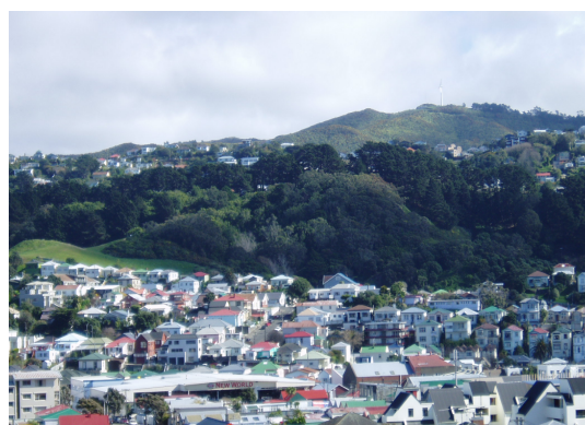
Visual diversity derived from variations in roof form, building height and topography.