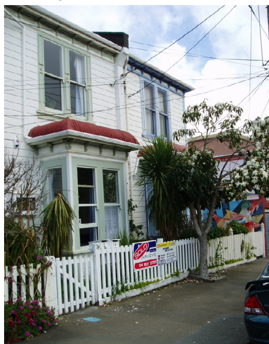
Neighbouring buildings, aligned with each other give a strong street edge definition

Variation of front yard dimensions usually relates to variation of topography. Dwellings on sites sloping steeply up from the street typically have deeper frontage setback than those on flat or downward sloping sites.