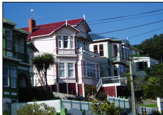
The undulating topography is a strong determinant of the area’s overall character

The area contains a relatively small number of multi-storey apartment blocks and town house developments of variable scale and layout. Most of the multi-unit development is located along or close to major streets and/or on larger or former industrial sites.