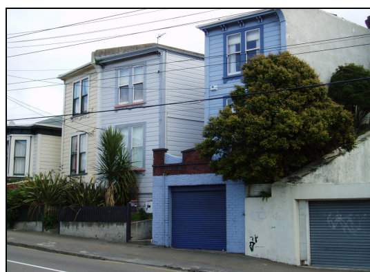
Defined street edge with buildings typically aligned with the street grid