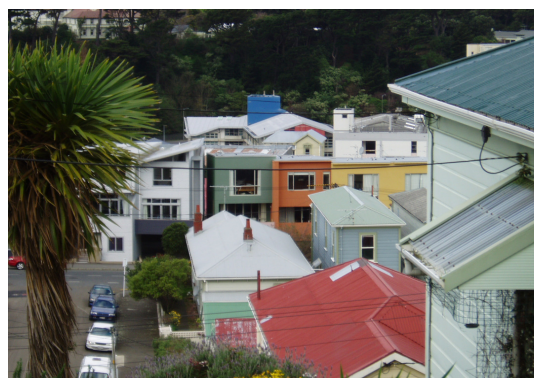
New multi-unit development around Tasman Street