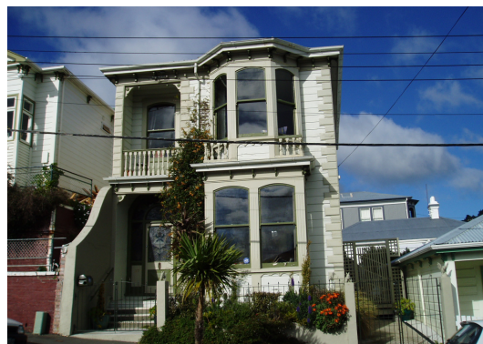
Entrances and main windows addressing the street

Currently most building exteriors are light in colour. However, houses built during the 1890-1910 period were traditionally painted in deeper colours with strong contrasts used to enhance decorative detailing and roof forms.