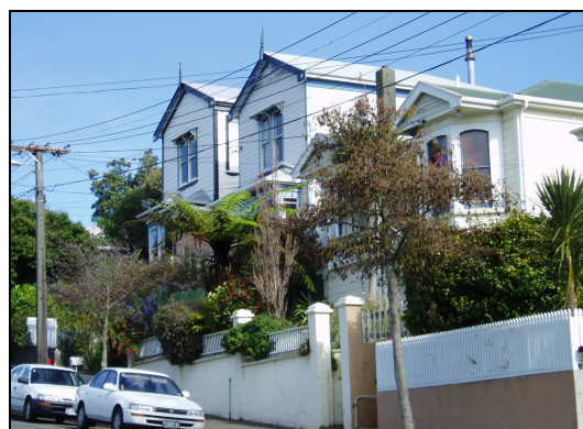
The area is a mixture of one and two storey dwellings

A combination of generally narrow lot frontages (average 10m width) and small separation distances (average 2m) creates a