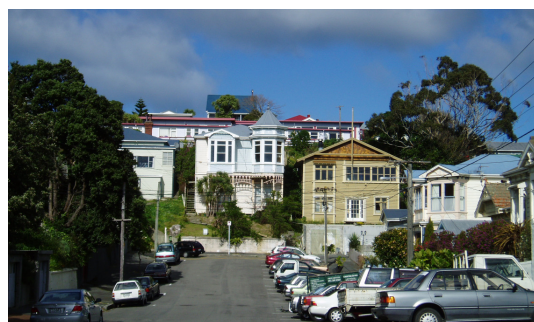
Manley Tce - an exceptionally wide cu-de-sac with a strong sense of place