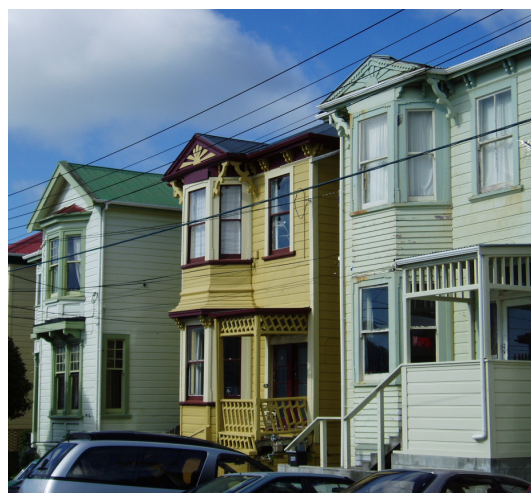
The Area is a highly intact remnant of residential housing from the first decade of the 20 th century

The general intactness of the area’s urban fabric is largely due to the relatively limited number of new developments. New development occurs primarily in the form of multi-storey apartment blocks, typical around Riddiford Street, Adelaide