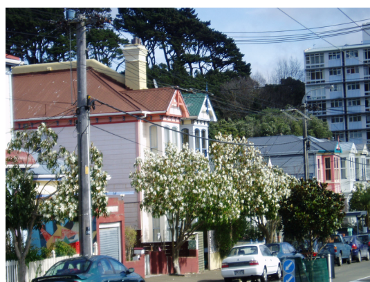
Distinctive local character with a strong sense of place

At the same time, the area exhibits a sense of visual diversity. This is derived from variations in roof form and building height, often accentuated by topographical variation and further enhanced by the presence of non-residential building types.