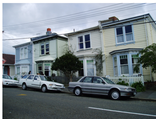
Consistency of character and a high degree of visual unity