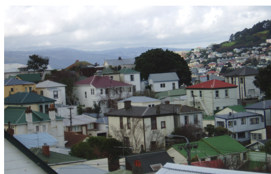
Intricate roofscape demonstrating consistency of roof type and pitch