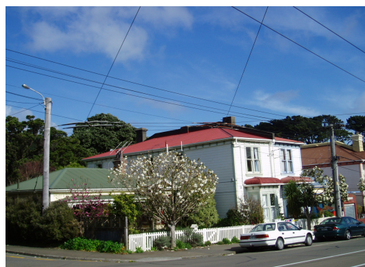
Limited range of building types