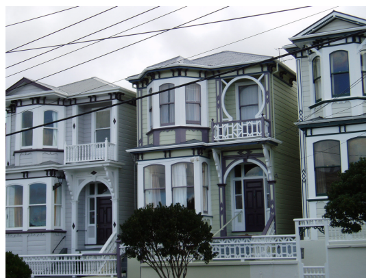
Wright Street - a notable concentration of original dwellings