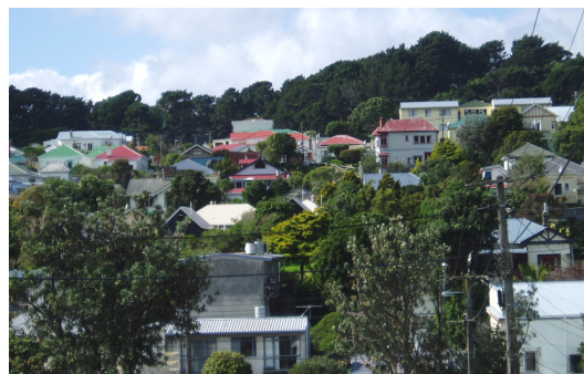
High intensity development is typically compensated for by mid-block open space with mature vegetation

High intensity of development is typically compensated for by mid-block open space, created by the aggregation of rear yards, often with mature and visually prominent vegetation.