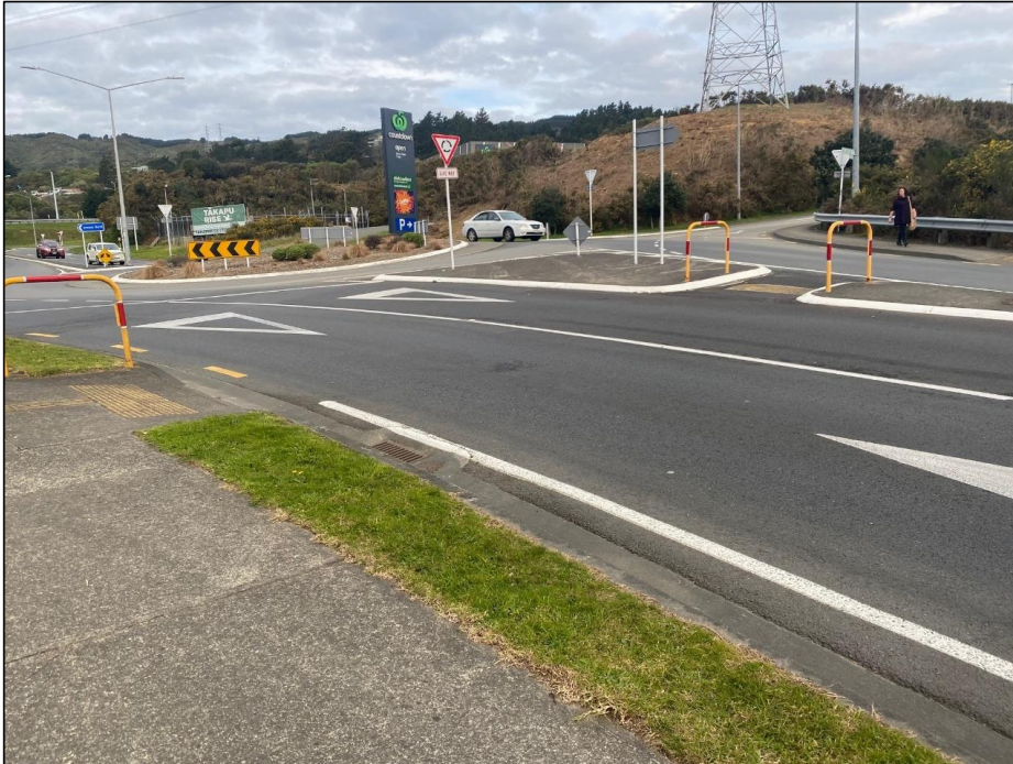
Figure 2: The key pedestrian crossing on Takapu Road of concern