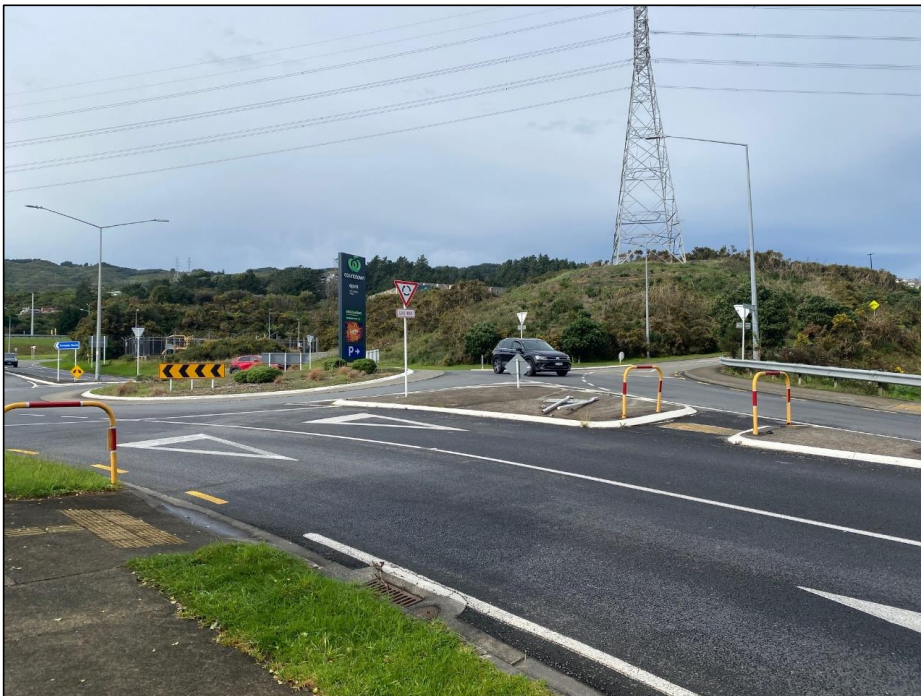
Figure 3: Sign knocked down following an accident on the pedestrian refuge in May 2023