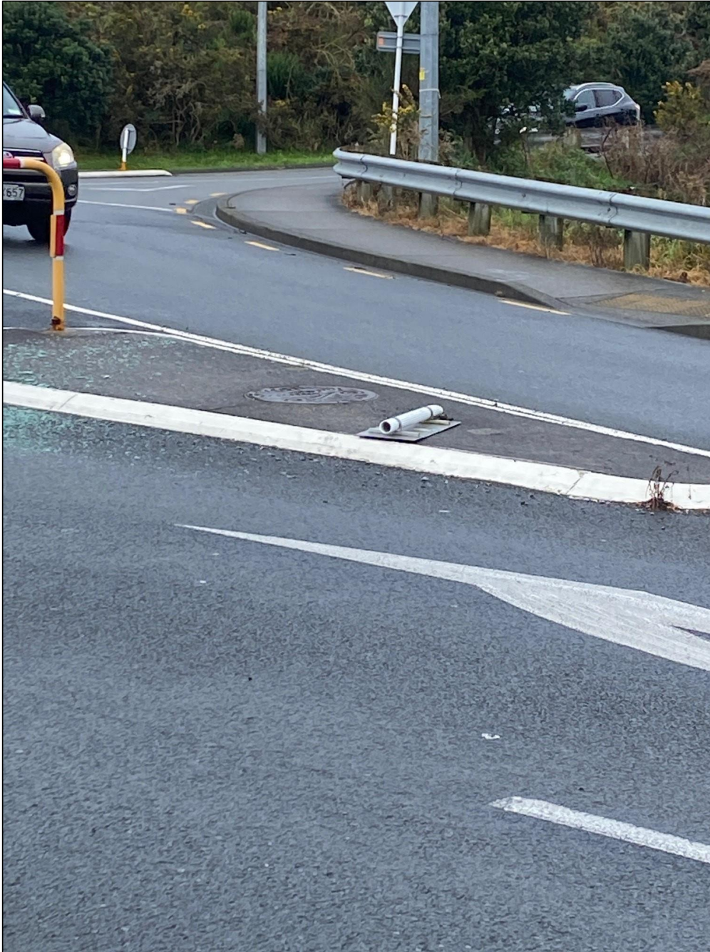
Figure 6: Another sign knocked down following an accident on or about July 23 rd 2023