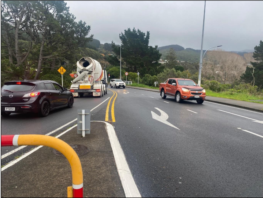
Figure 7: No visibility of oncoming vehicles at peak traffic times