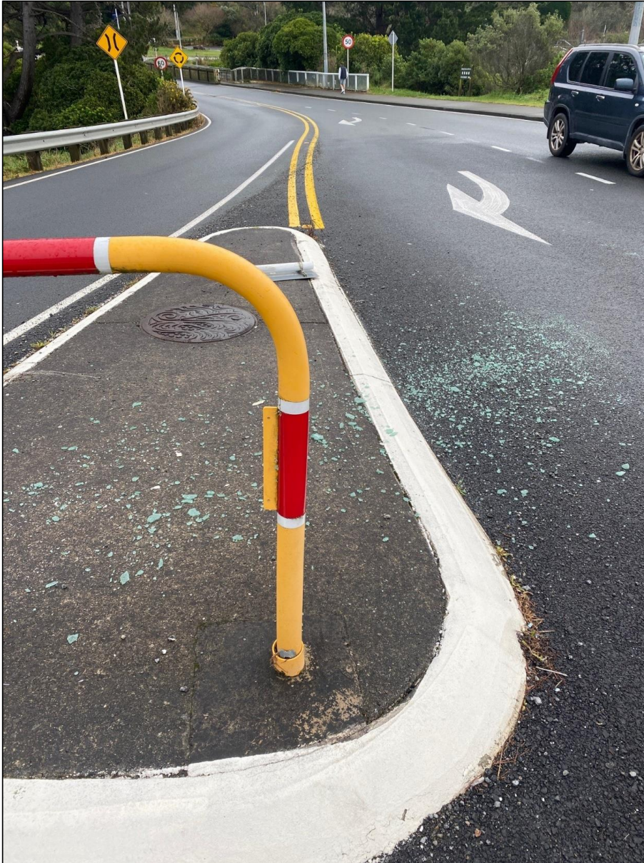
Figure 5: Smashed glass following an accident on or about July 23 rd 2023.