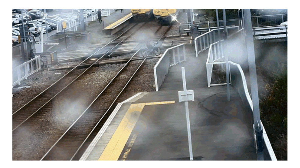
Near collision 29 March 2017, image from platform CCTV, northbound train travelling 55kmh