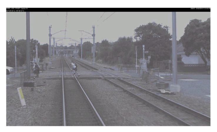
Near collision 25 February 2016, image from Matangi express train, travelling 85kmh