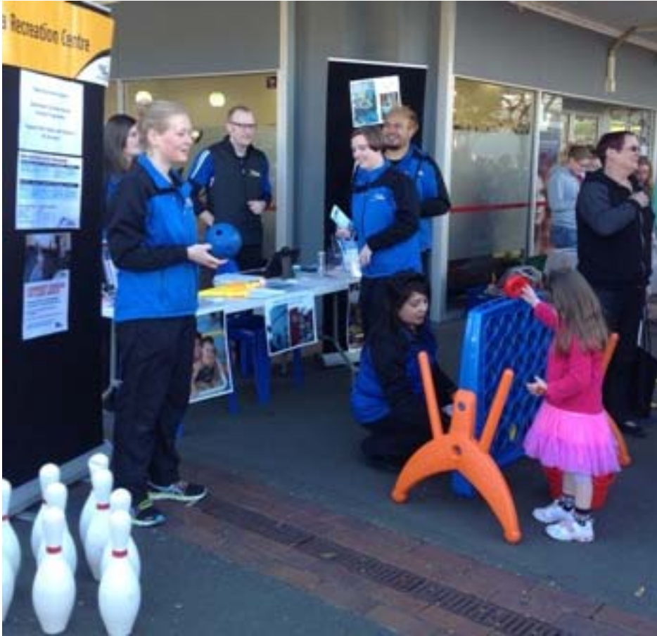
Tawa Pool and Recreation Centre stall “Spring into Tawa”.