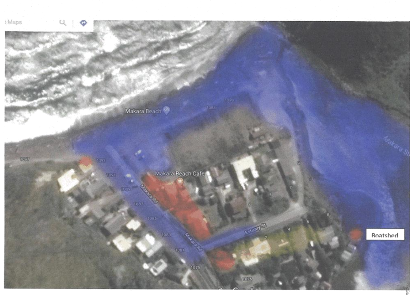
Blue - Areas reached by storm surge

Red – Property damaged caused by storm surge. All damage except the boatshed was from water that entered through the carpark or road