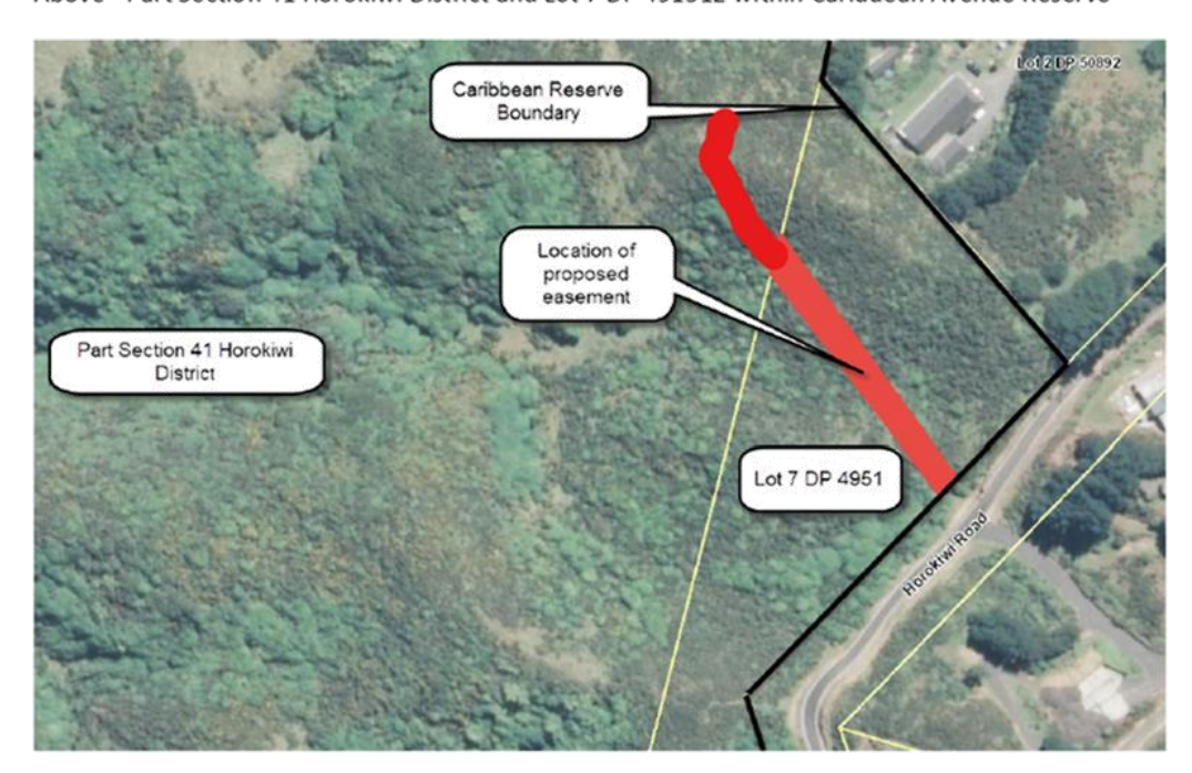
Above - Close-up plan showing location of proposed easement