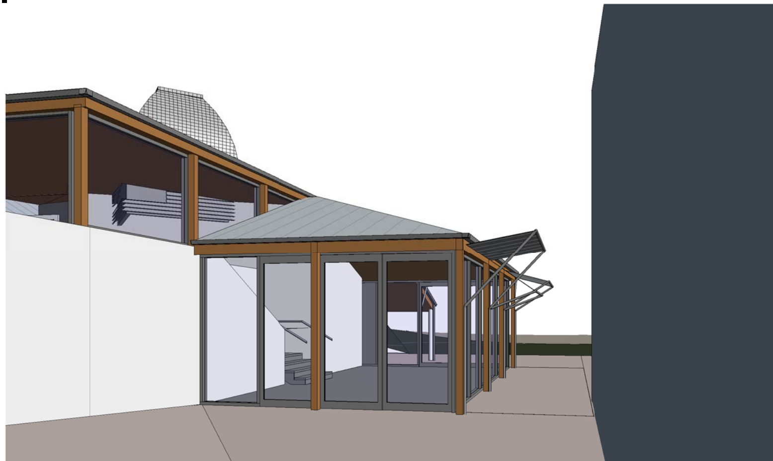
3D View 3