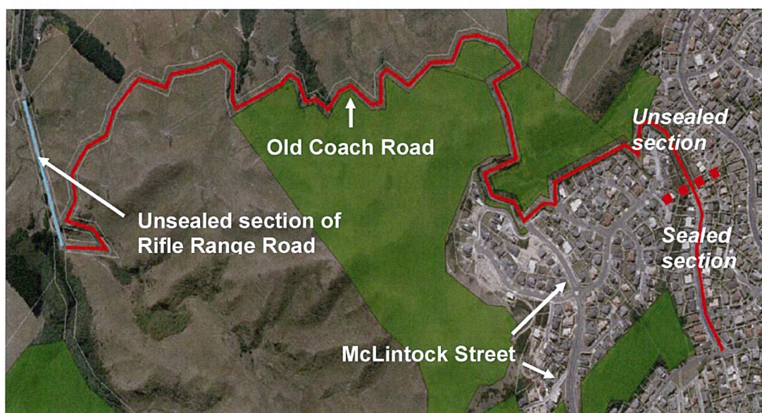
Figure 1: Map of Old Coach Road (highlighted green areas = Council owned land)

Residential housing in Johnsonville borders the unsealed Old Coach Road. As part of the earthworks associated with the development of the housing on McLintock Street, approximately 250m of the original track was covered with fill in the early 1990's.