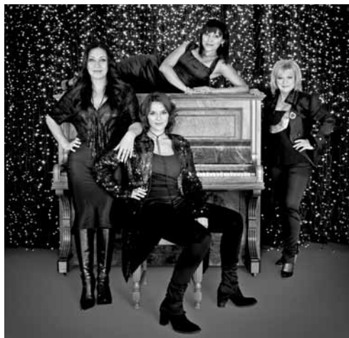
THE LADY KILLERS