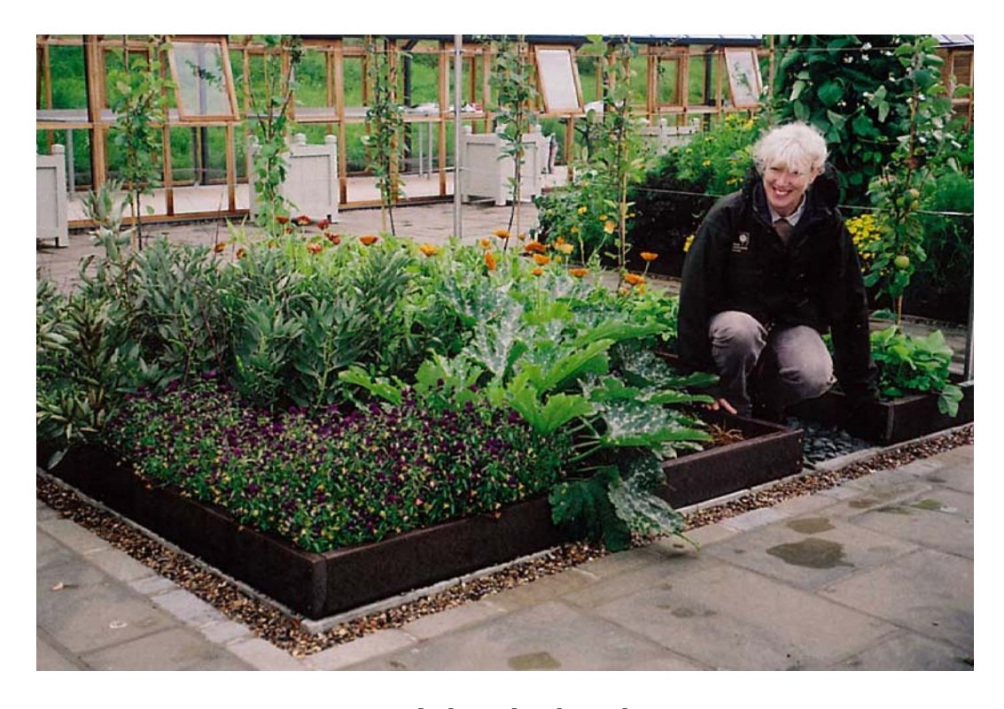
Recycled garden boards.

The RHS also demonstrated the potential of recycled material. We were shown raised plant beds with what appeared to be 100mm x 25mm wooden frames surrounding them. These "boards" were in fact made of recycled plastic bags and tinted a wood colour. Approximately 200 bags are used to make one metre. I will pass on the details of the recycling company Marmax Products Ltd to our Parks Officers.