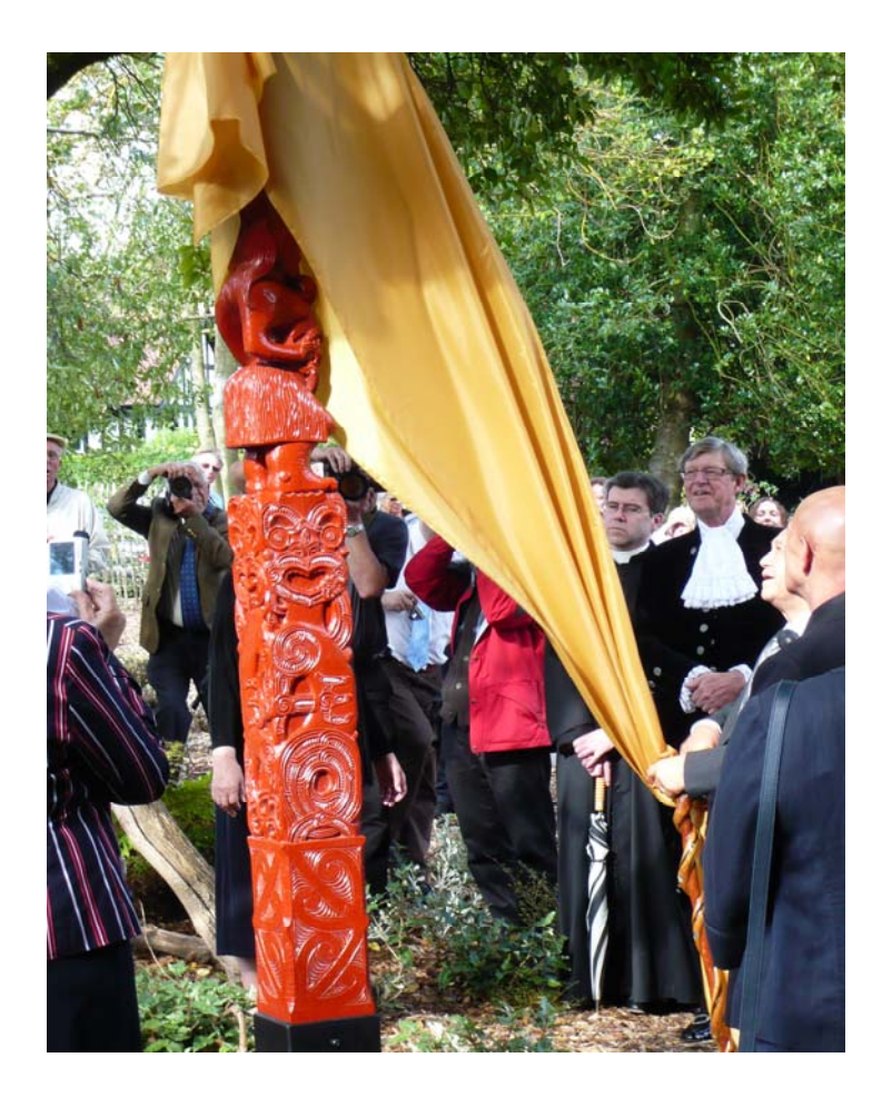
Unveiling of the pou whenua