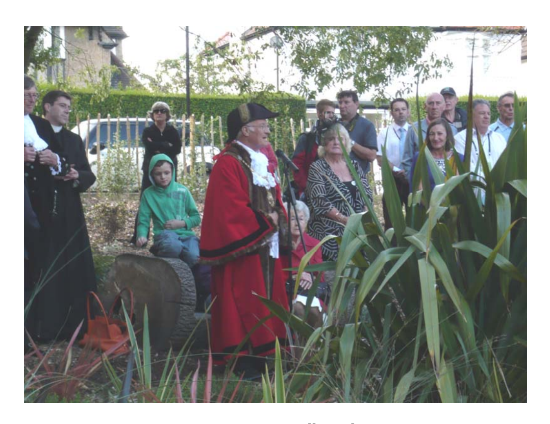
Mayor Bill Hoult

Attendees at the ceremony included: the Mayor of Harrogate Borough Bill Hoult, local Councillors, Harrogate City Choir (SPARX), members of the Golden Oldies World Cricket Festival, local residents, ex-patriot New Zealanders and Air New Zealand representatives. There were approximately 200 people in attendance.