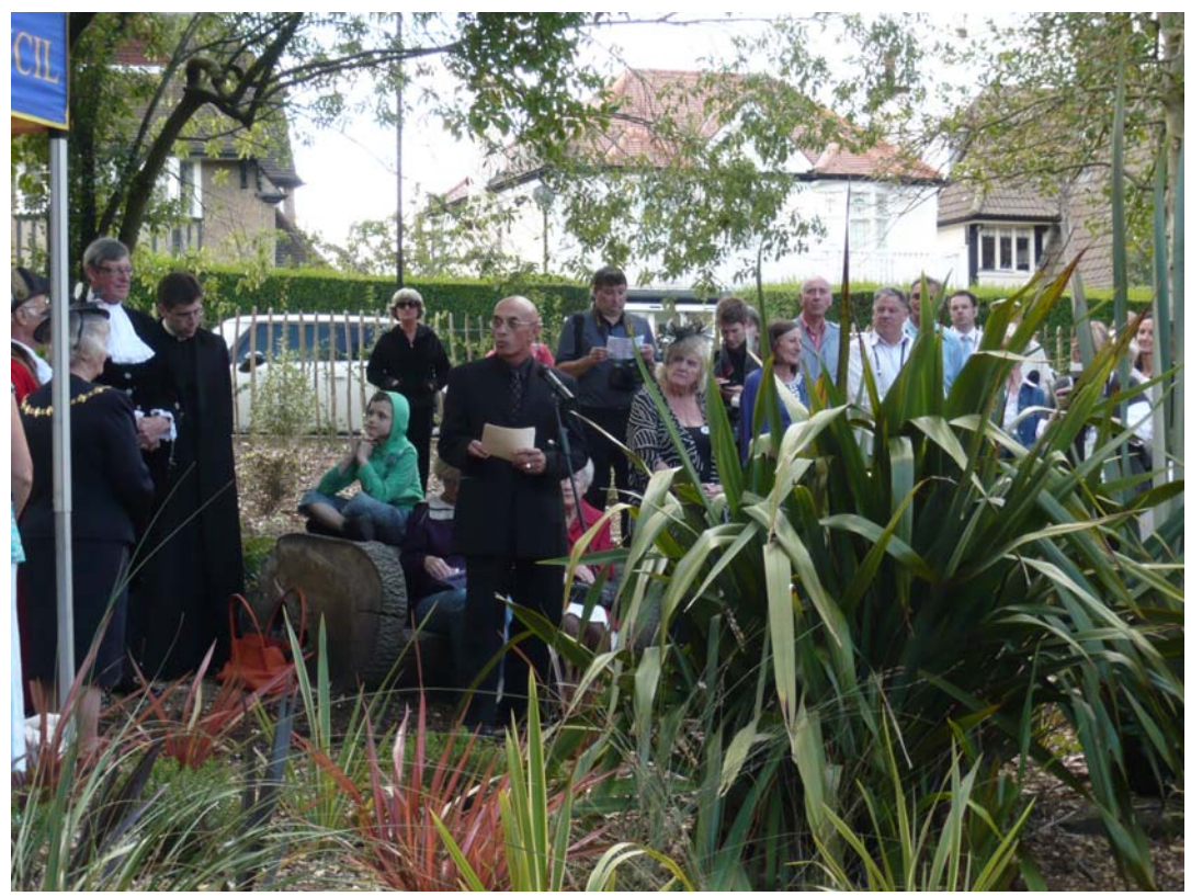
Speech by myself on behalf of Wellington City Council