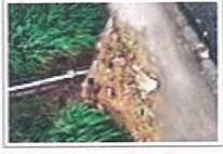
Give them Heaps015.jpg