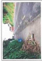
come upon Huge Slip 8 days Ntghm09.jpg