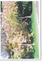
Nottingham 52 Burst sewer Kar Rd016.jpg