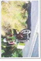
mot scooter fpath robertson ohio ...