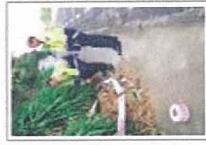
fire adjust danger tape slip Ntghm05.jpg