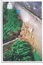
Gerry M tripped got hurt014.jpg