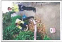
danger steady pile mud ntghm04.jpg