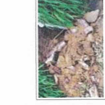
this looks Bad 54 Ntghm KAR010.jpg