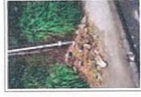
Thats Stuffed it Plmbr KAR012.jpg