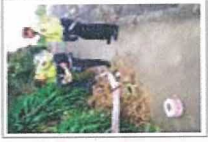
danger tsprt conctr rock ntghm03.jpg