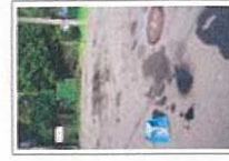
OIL spill Bus Circle Hutchsn022.jpg