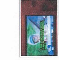
warning list tsun do sthg03.jpg