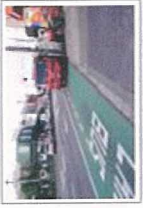
Bus Stop Wheeli Bin Adel Tax:019.jpg