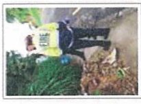
this wat I think Slip Ntghm07.jpg