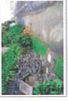
Not ingham v nice Ftpath011.jpg