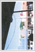
afromix ridd wire002.JPG