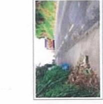
here comes help fire slip Ntghm08.jpg