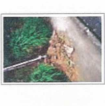
What a SHT WCC fpath Ntghm013.jpg