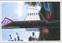
4472 danger wireh loop0027.jpg