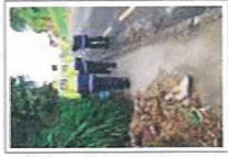
dang pipe take wander 54 Ntghm06.jpg