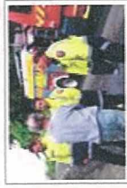
fire slip ntghm discuss w nbr01.jpg