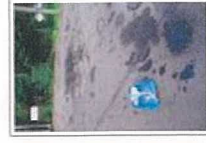
Oil spills Sept Oct o9 023.jpg