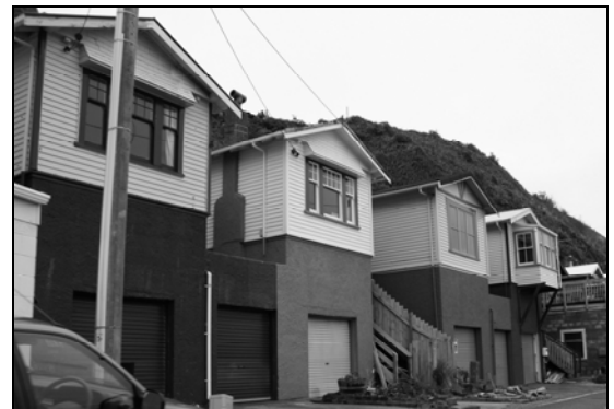
Car parking is typically under or at the back of dwellings

Car parking is typically in garages and generally integrated with the building on the ground floor of the residence or provided for at the back of a building. Accessory buildings in front of dwellings are generally discouraged.