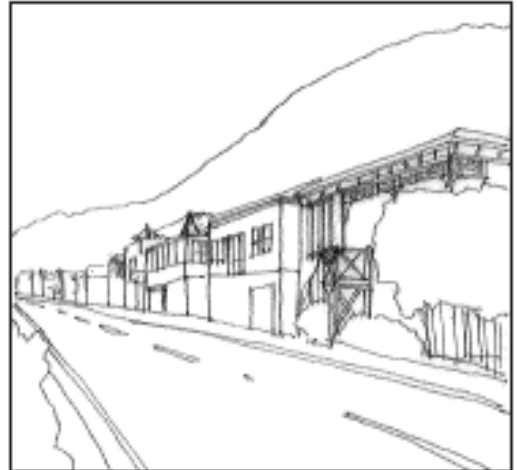
The area is a mixture of one and two storey dwellings

The generally consistent heights of one or two storeys (only a few are taller) above street level along the Residential Coastal Edge generates a clear line in perspective and also serves to accentuate the linear coastal edge and define the escarpment above.