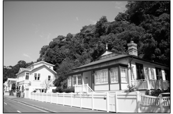
Buildings are generally orientated towards the road

Although there is a diverse range of building types there is a commonality of design features throughout the area such as (often large) windows, entrances, decks, balconies and their attendant living spaces that are orientated towards the road.