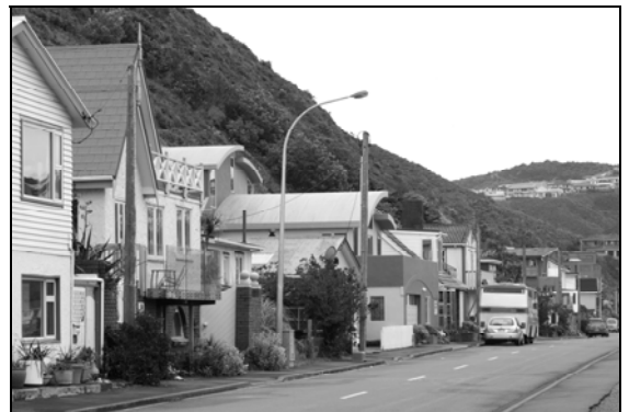
The minimal setbacks have lead to very shallow or no front gardens

Where there is a setback, most properties have front fences which continue the line of the road edge. These are generally at a height that still enables a visual connection between the residents and the public.