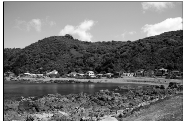
Strong relationship between the natural and built environment

The Residential Coastal Edge is a highly valued residential area with strong amenity value. The area is also an important recreational destination. The steep escarpment behind the dwellings further defines the Residential Coastal Edge by pushing the buildings to the street edge thus increasing the sense of interaction between the public and private dimensions of the area.