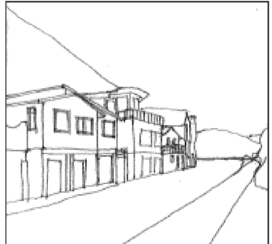
Strong edge definition

Where there is no setback, the visual connection between the inhabitants and the public life of the coastal road is further intensified.