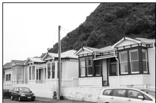
Small groupings of consistent styles

There are also a number of individual 'remnant' baches from when the coastal edge would have attracted weekend use or possibly would have been used by fishermen. The only consistency of these buildings is perhaps their age and modest nature, but their materials, form and styles are variable.