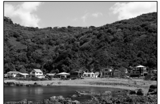
Strong relationship between the built environment and the escarpment

The steep topography around the Residential Coastal Edge has meant that in most cases the escarpment is still generally intact and undeveloped. This has given it a visual prominence and intensity that makes it more sensitive to changes in character than a typical suburban streetscape. Development that altered this escarpment (through increased building heights or development within the escarpment) would negatively impact on this character.