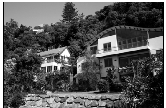
Mixture of roof forms

The Residential Coastal Edge is characterised by a mix of roof types including skillion, curved and papapet/flat, gable and hip roofs.