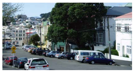
Carparking is typically on the street

Most of the existing garages are found along the higher side of streets. Garages on steep frontages, typically built into the slope and located in front of and below the dwelling, have a lesser impact on the streetscape than free-standing garages.