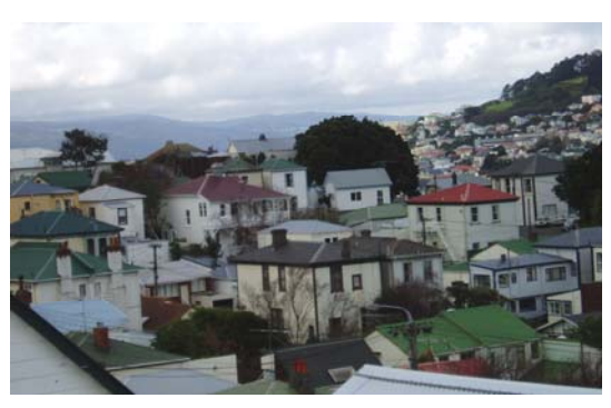
Intricate roofscape demonstrating consistency of roof type and pitch