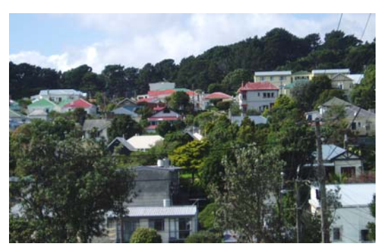
High intensity development is typically compensated for by mid-block open space with mature vegetation

Variation of front yard dimensions usually relates to variation of topography. Dwellings on sites sloping steeply up from the street typically have deeper frontage setback than those on flat or downward sloping sites.