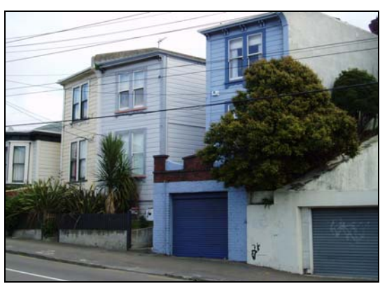
Defined street edge with buildings typically aligned with the street grid