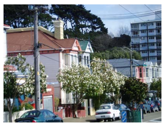
Distinctive local character with a strong sense of place

At the same time, the area exhibits a sense of visual diversity. This is derived from variations in roof form and building height, often accentuated by topographical variation and further enhanced by the presence of non-residential building types.