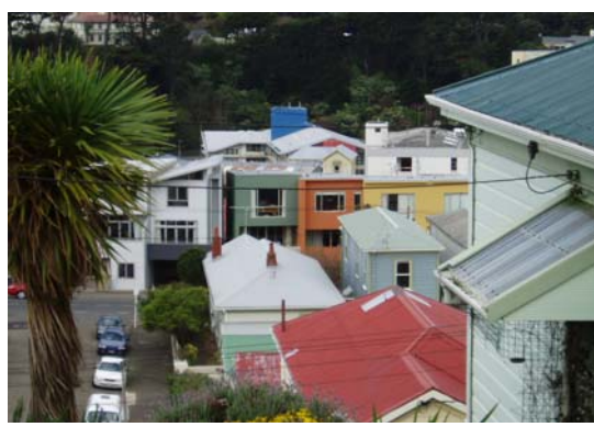
New multi-unit development around Tasman Street