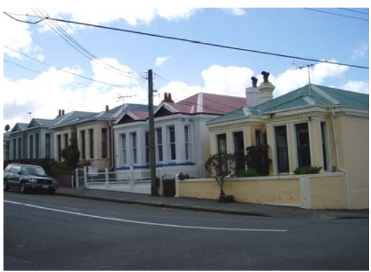
Consistency of building type and scale - notable grouping of semi-detached brick dwellings at the southern end of Rintoul Street