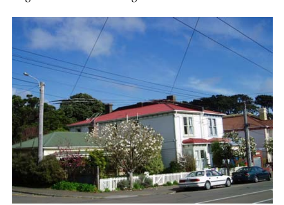
Limited range of building types