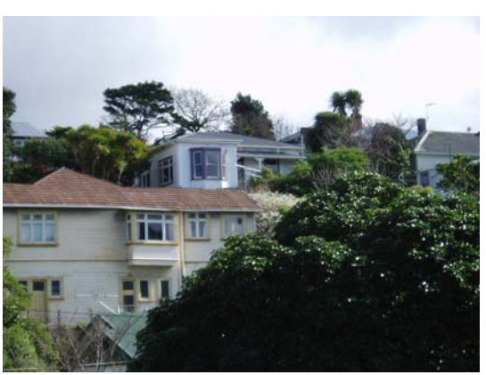
Akatea Street - strong streetscape presence accentuated with prominent mature vegetation