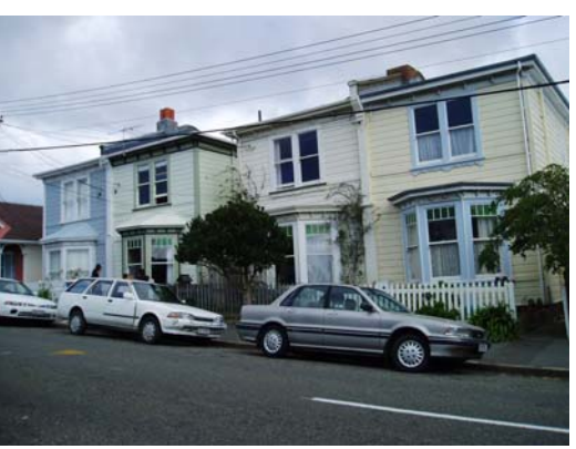
Consistency of character and a high degree of visual unity