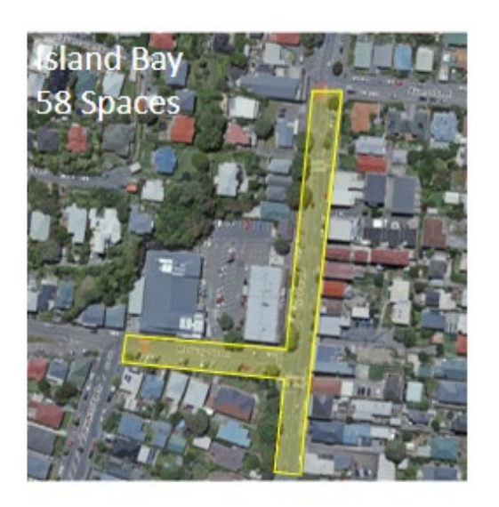
Extent, location and number of proposed metered parks to be determined