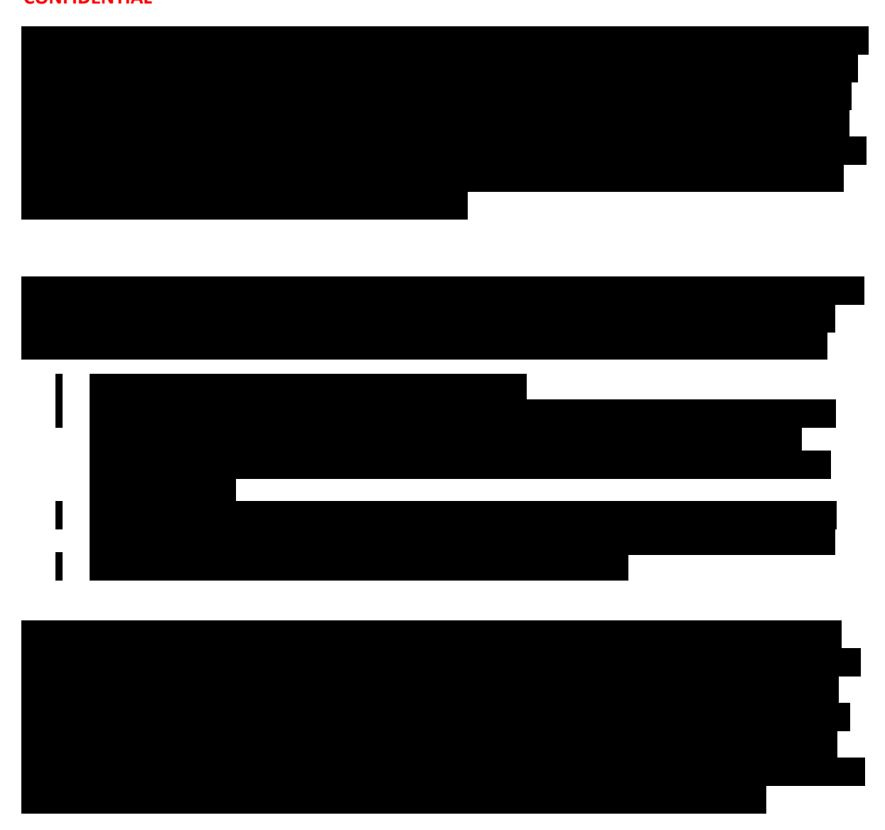
249. Page 9: A saving of 1.7% is shown through the "sale of surplus assets". Can a list of these asset be provided? CONFIDENTIAL

248. How in the budget is op ex savings in the budget for the council accommodation? CONFIDENTIAL