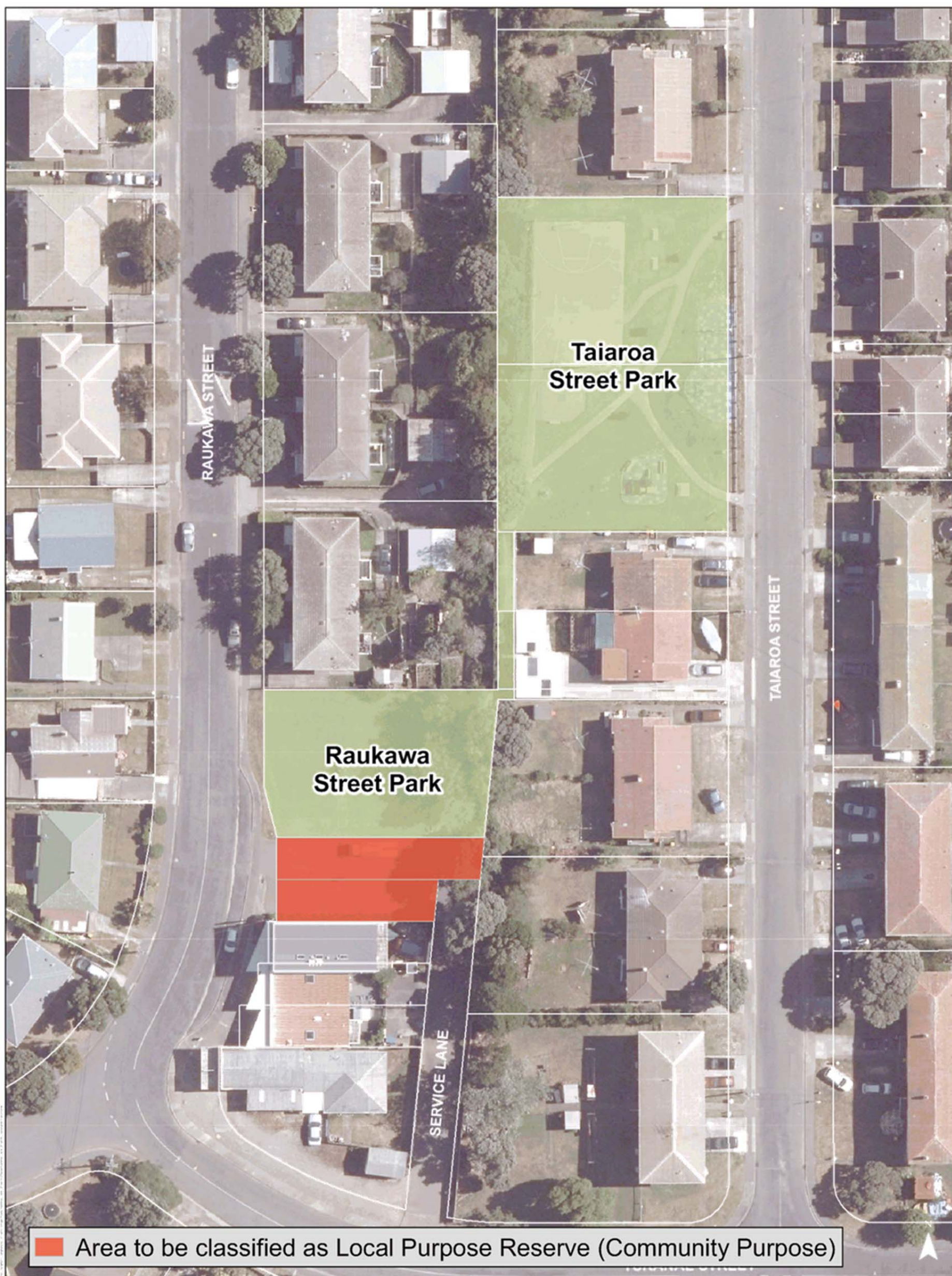
Location of Raukawa Street Park and Carpark