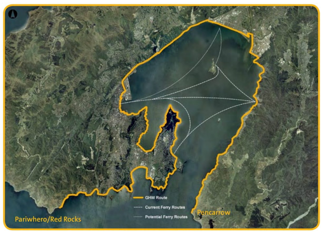
Diagram is from the excellent Boffa Miskell Report<sup>5</sup>