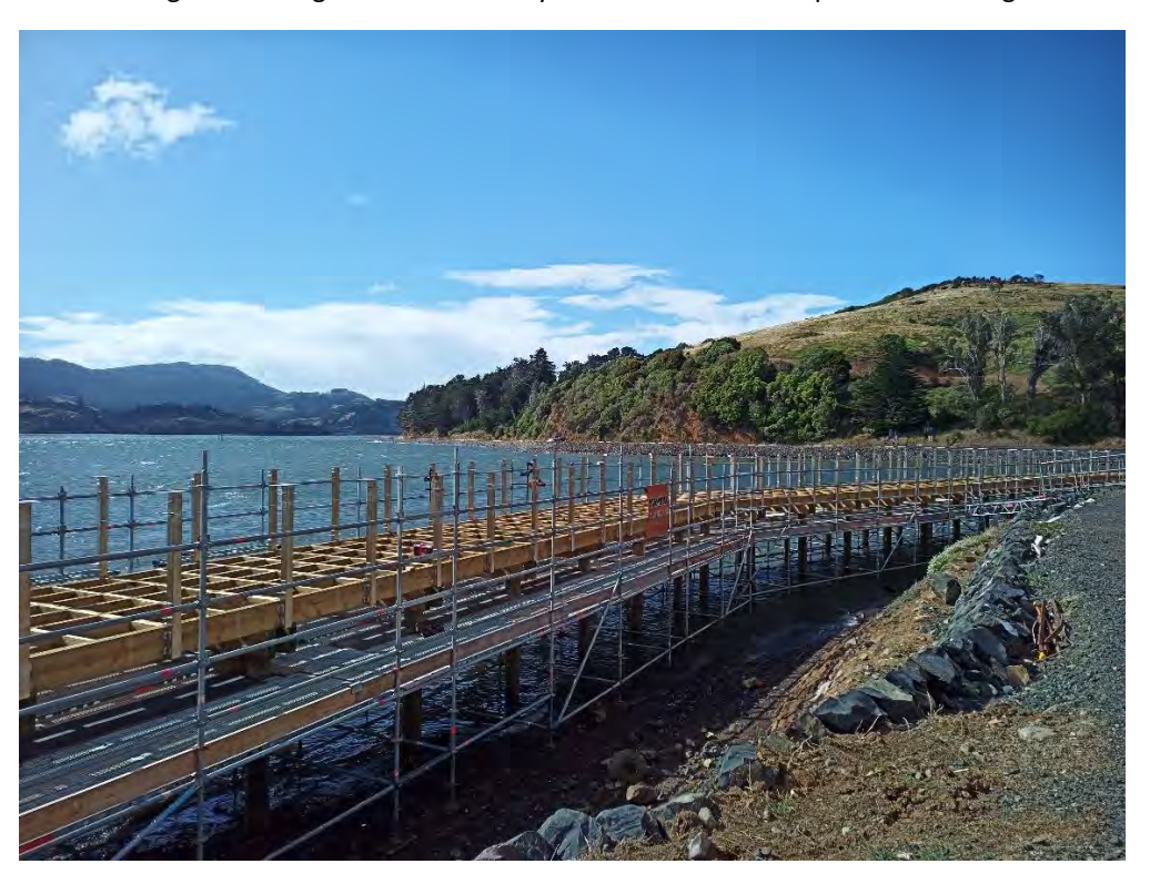
Lake Dunstan cantilevered sections<sup>11</sup> could suit Kaiwharawhara to Aotea Quay

We recommend the separate path on piers for areas like the Miramar peninsula. It is less disruptive than reclamation and no change to existing roads is necessary. This must be an acceptable solution given its current construction.