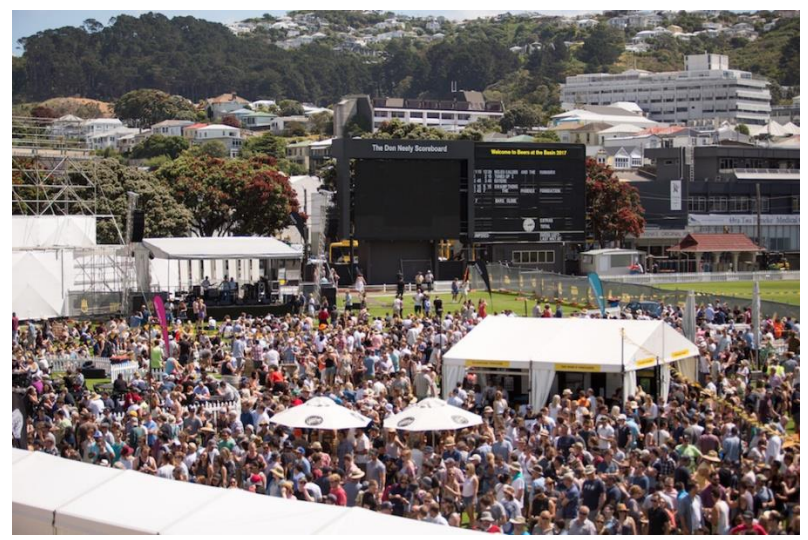
Beers at the Basin - 30 November 2020

The Wellington Scottish Athletics Club Night of Miles event which has been an annual feature on the Basin Reserves event calendar was held at Newtown Park in 2019. This event will return to the Basin in 2021 – this has led to a quarter two reduction in other sporting events.