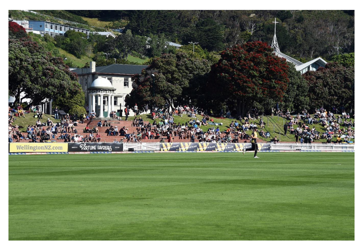
Christmas at the Basin – 21 December 2020