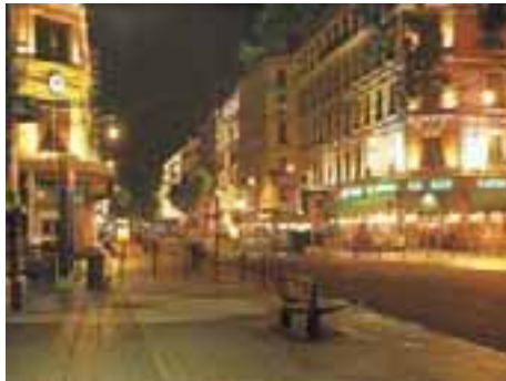
Along Rue de la Republique the idea is to highlight the streetscape with overall facade lighting.