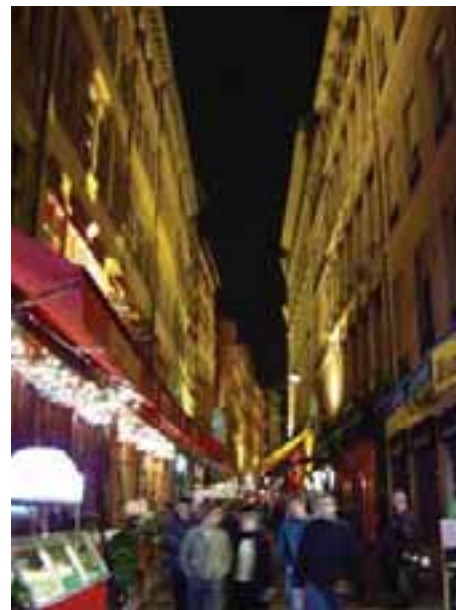
Night time ambience in the lanes created largely by facade lighting.

Work is ongoing to light the main street of the city, Rue de la Republique, with a system of facade lighting that emphasises the central importance of public space while giving pedestrians soft, functional lighting reflected by the facades. The plan is being carried out gradually as building owners pay to have the lighting fixtures installed, after which they are run and maintained by the municipality.