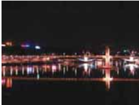
Special illumination of city bridges and important sights along the river