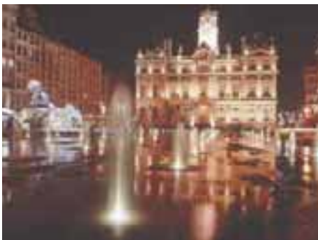
Place des Terreaux is distinctive for its surprising use of water and lighting.