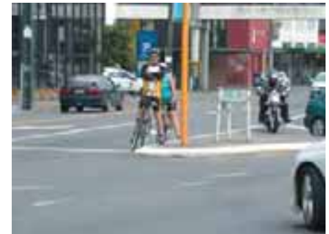
Cyclists ride on the same terms as vehicular traffic