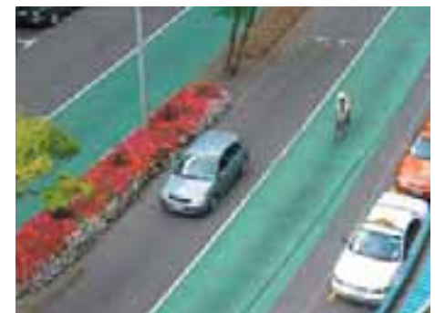
Dedicated bus lanes are used as cycle lanes