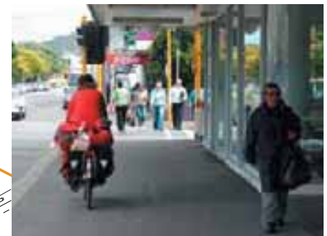
or in conflict with pedestrians