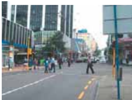
3.Willis Street // Manners Street