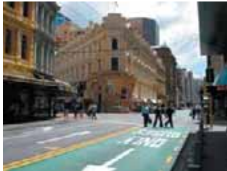
1.Lambton Quay // Willis Street