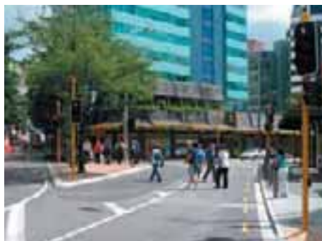
4.Manners Street // Manners Mall