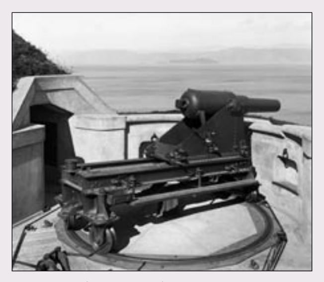
A 64 pounder RML (rife muzzle loading) gun at the newly erected Fort Buckley, some time after 1887.