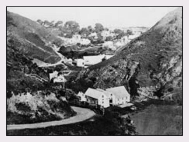
Schultze's flourmill, in the foreground, from Old Porirua Road in 1878. The dam formed the lake to the right.