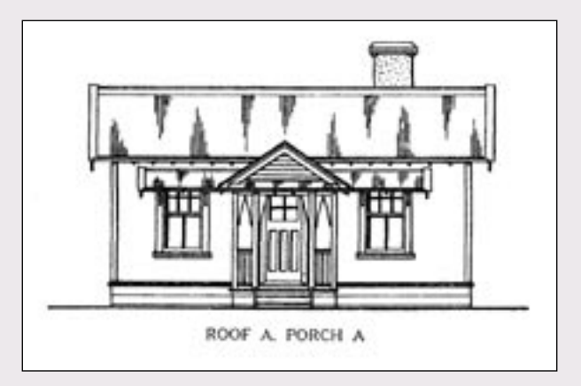
Plan A, one of four variations in porch and roof design found in the early houses at the Tarikaka Street railway settlement.

At Ngaio, the Railways Department bought eight hectares of land from the Aplin family in 1927 for £10,000 and within a year 93 houses had been built. Later, in the 1930s, more houses to different designs were built. Railway employees leased these houses for more than 60 years until they were sold by New Zealand Railways as part of a disposal of non-strategic assets. Many long-term tenants bought their houses.