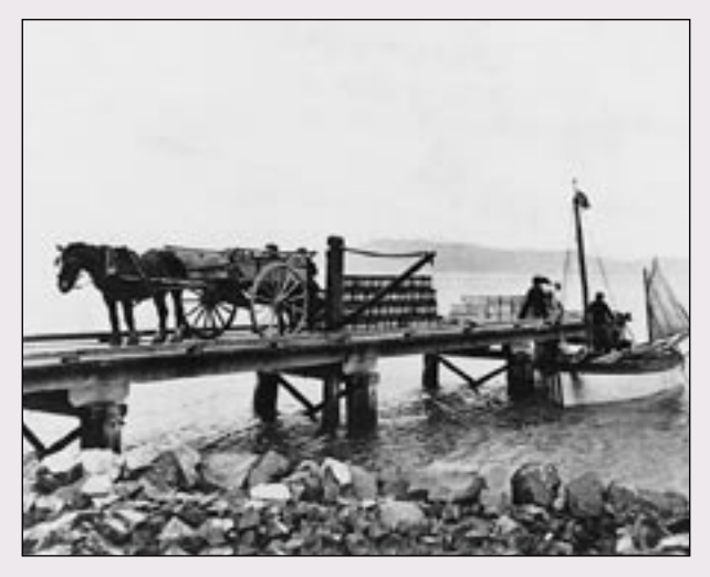
Unloading of explosives at Kaiwharawhara Wharf, 1906. The jetty was built in 1885, at the beginning of the second Russian scare.

along with Fort Ballance on the Miramar Peninsula, the most intact 'Russian Scare' fort in Wellington. Although it is difficult to imagine today, there was a track up to the fort from here. Gun shells were loaded from boats at the Kaiwharawhara wharf onto handcarts. The carts would then be pulled to the foot of the track and hauled up to the fort. There is a tunnel beneath the fort, built for the Wellington–Manawatu Railway in 1882.