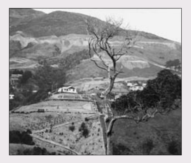
Otari Wilton's Bush in 1932 with Leonard Cockayne's native plant museum laid out on the slopes. The regrowth of the forest since then has transformed the reserve.