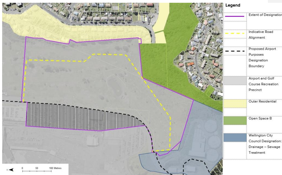
Figure 2: Extent of Designation and Proposed Airport Purposes Designation Boundary Overlaid

43.45. Upon confirmation of this notice of requirement the Requiring Authority shall uplift that part of designated Airport Land [main site designation reference once known] that overlaps with the ESA Designation Designated Area depicted within the hatched area in black in Figure 2 below.