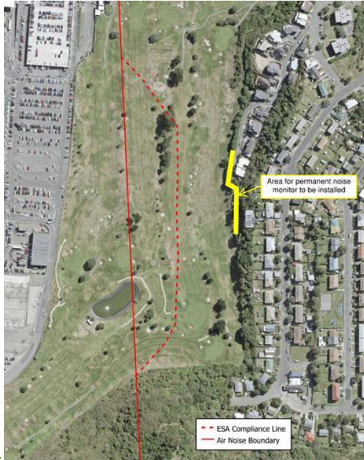
Figure 1: Aircraft operations EEA compliance line. SUPERCEDED