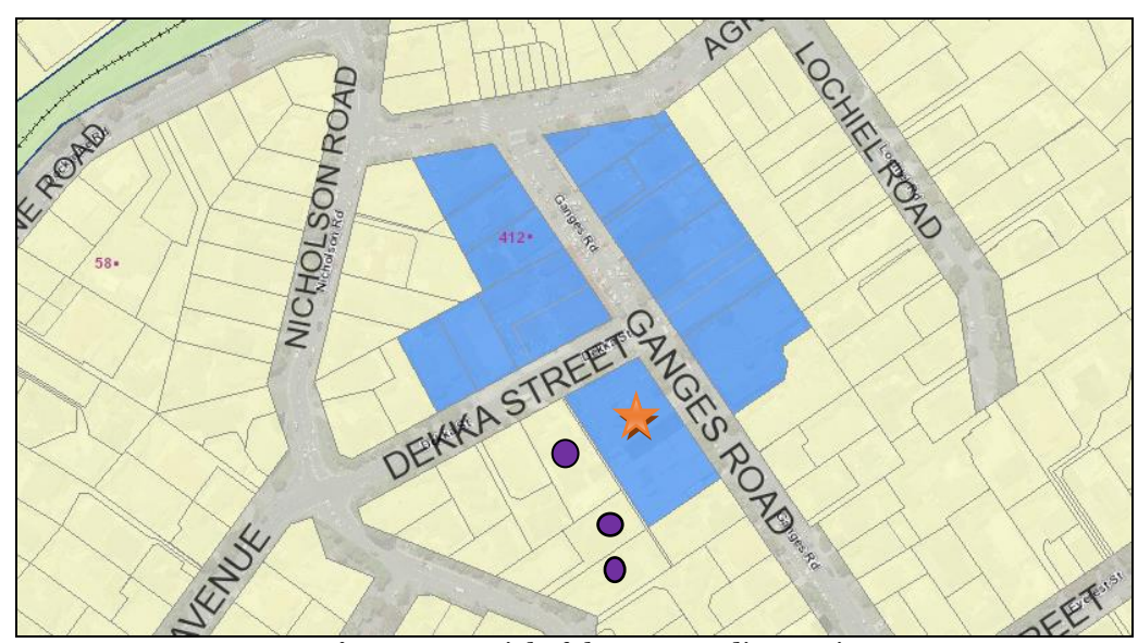
Figure 2: Aerial of the surrounding zoning.