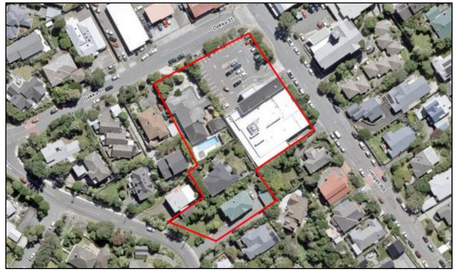
Figure 1: Aerial view of the subject site and the surrounding environment.