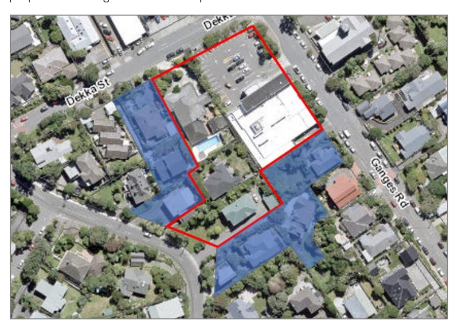
Figure 18: Adjoining residential properties to the west and south shaded blue

Notwithstanding, while some residentially zoned sites do accommodate a non-residential use, these activities generally operate from existing dwellings or purpose-built buildings such as churches, schools, etc. In this case, it is acknowledged that these directly adjoining neighbours would not have anticipated a commercial car park being located next door to them. Given this change in character, it is considered that effects on their amenity will be noticeable and adversely affected. Given the aforementioned acoustic fencing and landscaping, it is considered that the proposal will not give rise to incompatible adverse effects that are more than minor.