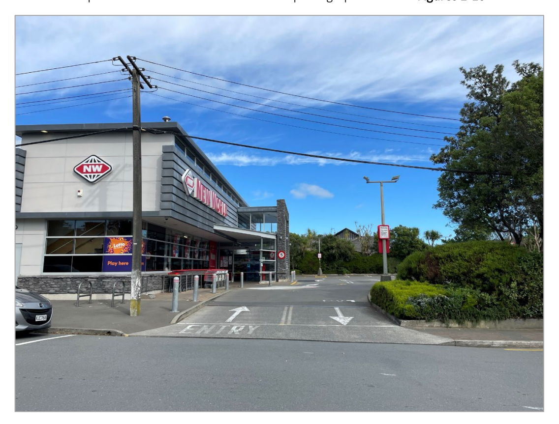
Figure 2: Streetscape view of the supermarket's existing customer entrance as viewed from Ganges Road

The streetscape views of the site are shown in the photographs below in Figures 2-10.