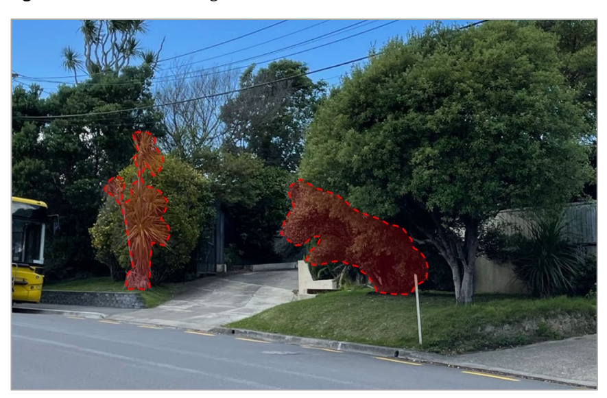
Figure 19: Dekka Street vegetation recommended for removal outlined in red

The proposal includes the retention of the majority of existing street trees. Notwithstanding, Commute's assessment ( Appendix 5 ) has identified some vegetation removal is required to ensure that sight distances from the Dekka Street and Nicholson Road vehicle accesses are acceptable. Figure 19 identifies the vegetation on Dekka Street.