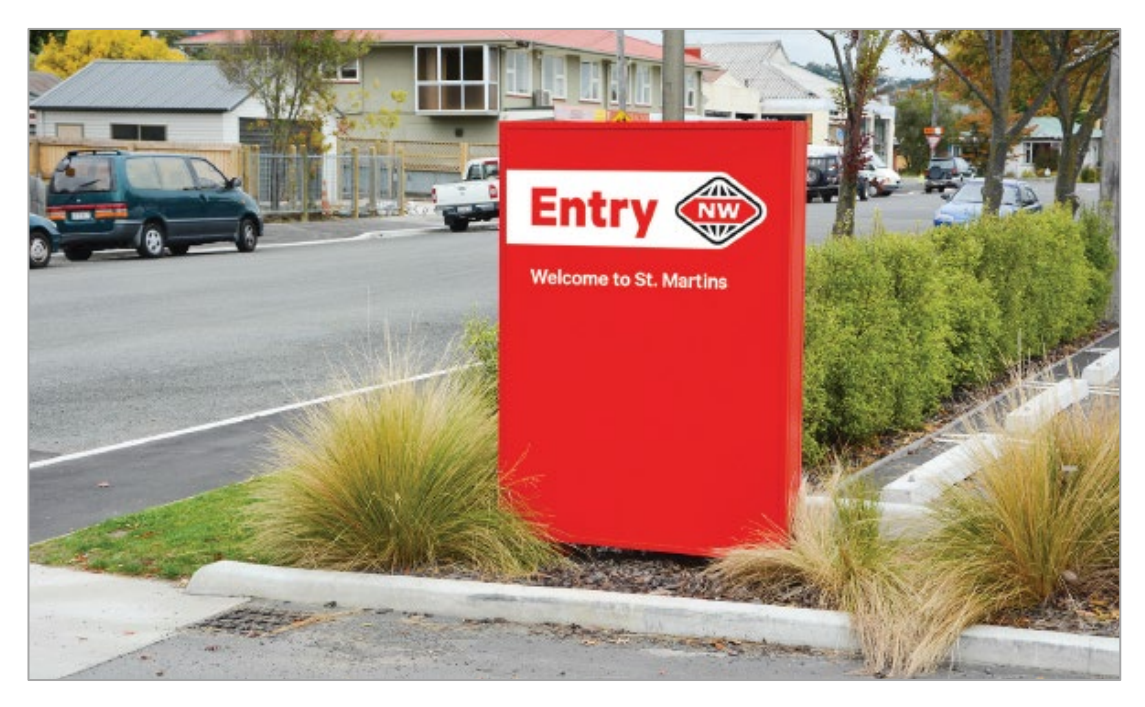
Figure 13: Example of New World car park entry sign in situ