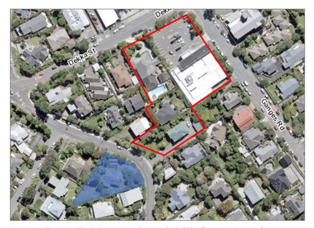
Figure 17: Adjacent residential property to the west shaded blue

It is considered that the proposed development will not give rise to adverse privacy, amenity, acoustic or reverse sensitivity effects to persons at this neighbouring property as it is located on the opposite site of the road to the application site which creates a separation distance of approximately 15m. The dwelling at 32 Nicholson Road is setback from the street frontage by 10m.