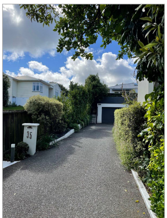
Figures 7 and 8: Streetscape views of 33 and 35 Nicholson Road