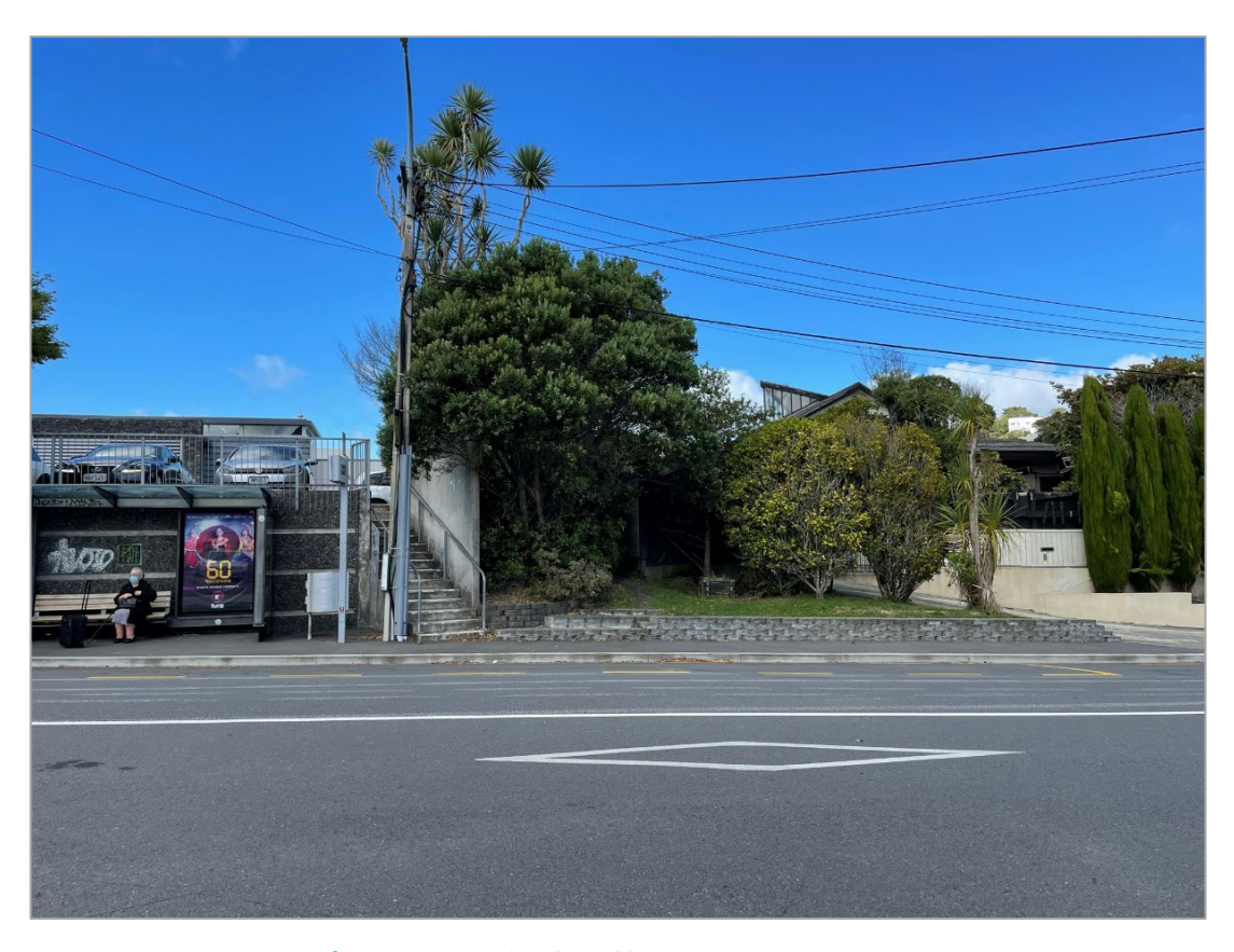
Figure 3: Streetscape view of 26 Ganges Road and 3 Dekka Street