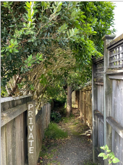
Figures 9 and 10: Jointly owned strip

As illustrated in the topographical survey ( Appendix 2 ), the site generally slopes up from the road boundaries with a change of approximately 7m in elevation across the site.