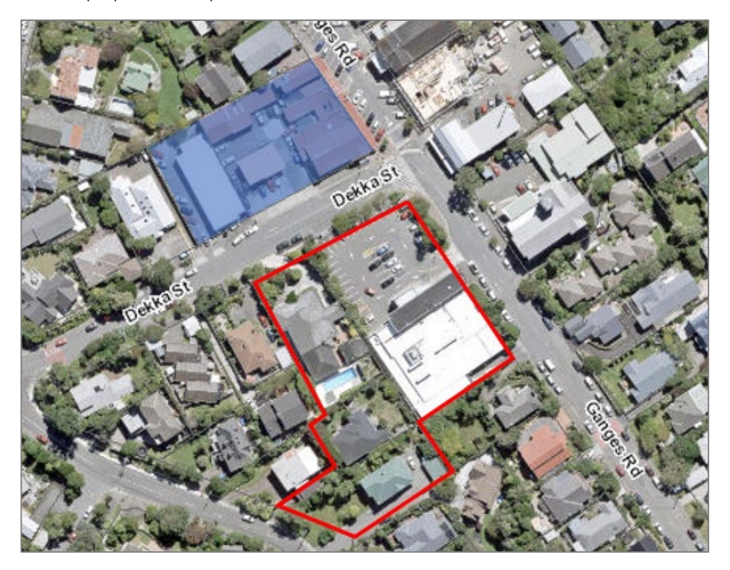
Figure 14: Adjacent commercial properties to the north shaded blue