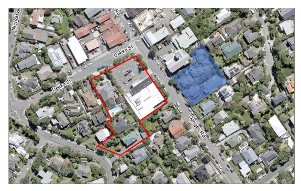
Figure 16: Adjacent residential properties to the east shaded blue