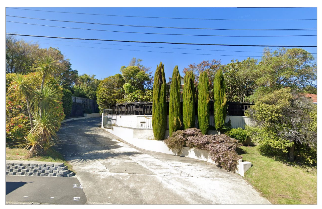
Figure 4: Streetscape view of 3 Dekka Street