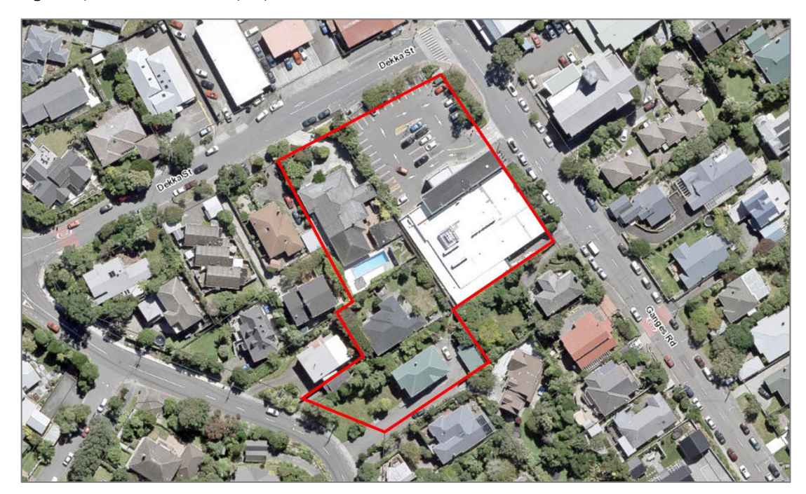
Figure 1: Locality photo with the site outlined in red

The irregularly shaped site has frontages to Ganges Road, Dekka Street and Nicholson Road (see Figure 1) and contains four properties.