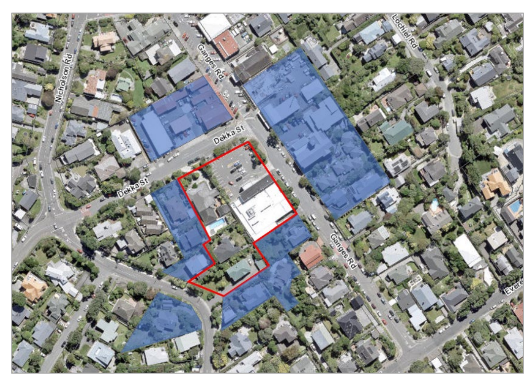
Figure 12: Adjacent properties in relation to subject site shaded blue