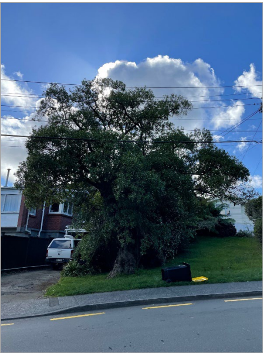
Figures 5 and 6: Streetscape views of 29 and 31 Nicholson Road