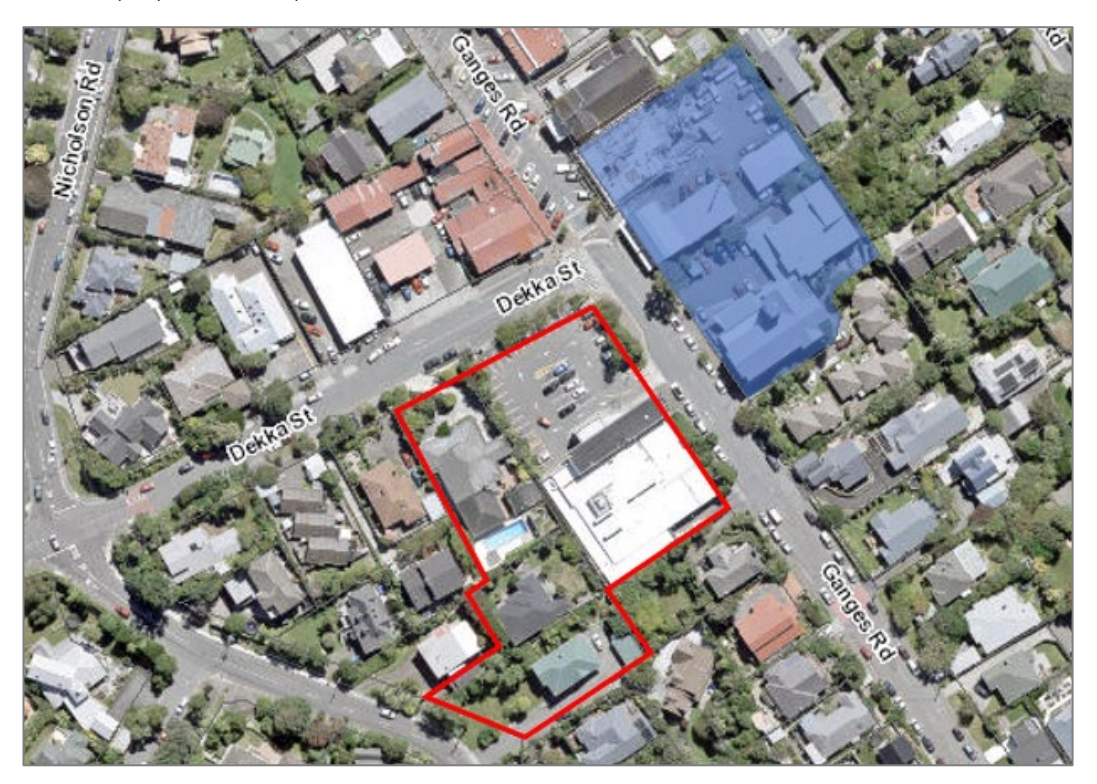
Figure 15: Adjacent commercial properties to the east shaded blue