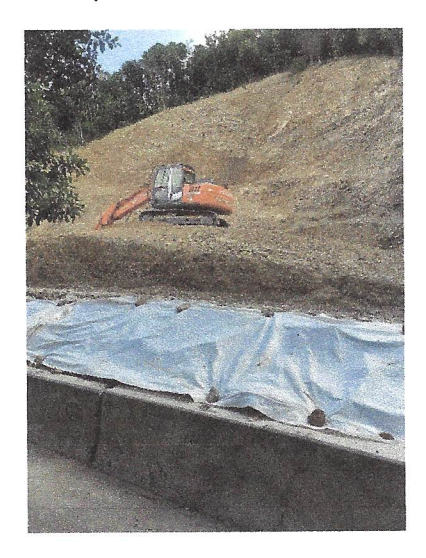
23-Feb-2022 Main Rd Tawa

The increased shade from the size of the building will also affect the growth of moss on damp footpaths increasing the danger of pedestrians slipping on them causing injuries and potentially someone falling onto the busy Main Road.