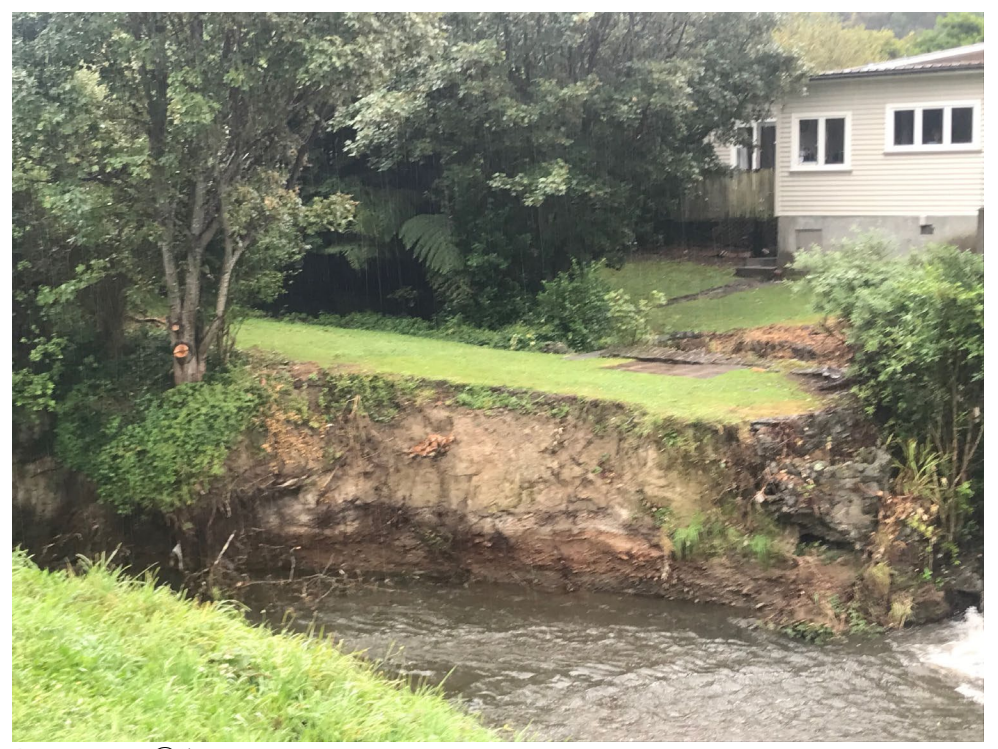
Upstream, @520 metres.

We were therefore very surprised to see from the ENGEO report that they did not in fact have plans showing the exact location of the proposed building, and that they were not aware of the batter angle of the slope or the material that comprises the slope. It has been stated that further geo-engineering investigations will determine the likelihood of scour at the base of the slope due the Porirua Stream. Our comments above about the way this section of the stream surges laterally and eddies when in flood suggest issues are likely to arise.