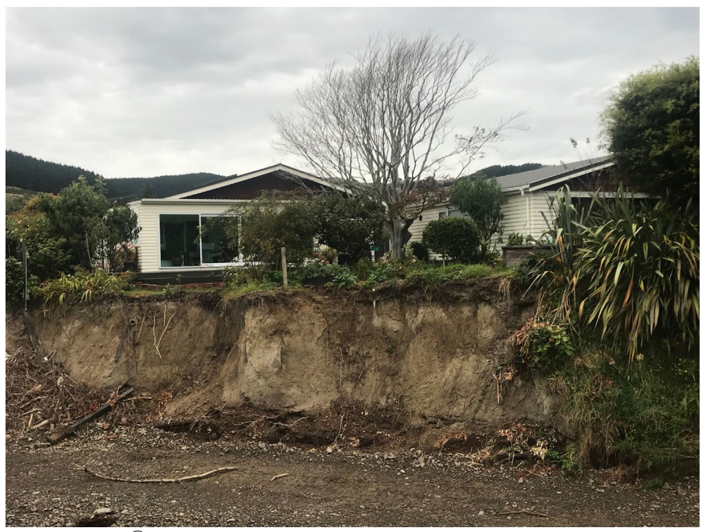
Downstream, @480 metres.

The Porirua Stream can be wild when in flood. The streambank of 292 Main Rd involves no significant meander, but in flood the flow surges laterally and eddies strongly against both banks as the river shoots past the more restricted section under McLellan St bridge. We have attached several photos of properties within several hundred metres upstream and downstream of 292 Main Rd which have experienced damage just in the last few months. You can see the serious bank erosion and collapse: in each case, several metres of bank have been lost, and retaining walls have collapsed into the stream. All of the streambanks are clearly vulnerable to erosion and change to different degrees: