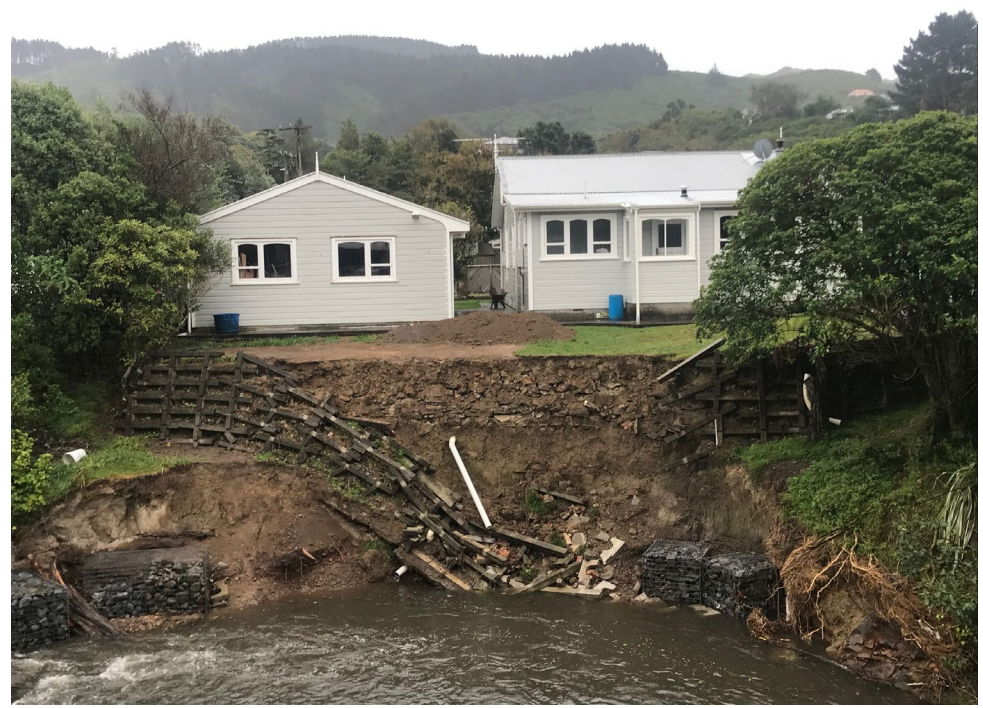
Upstream, @500 metres