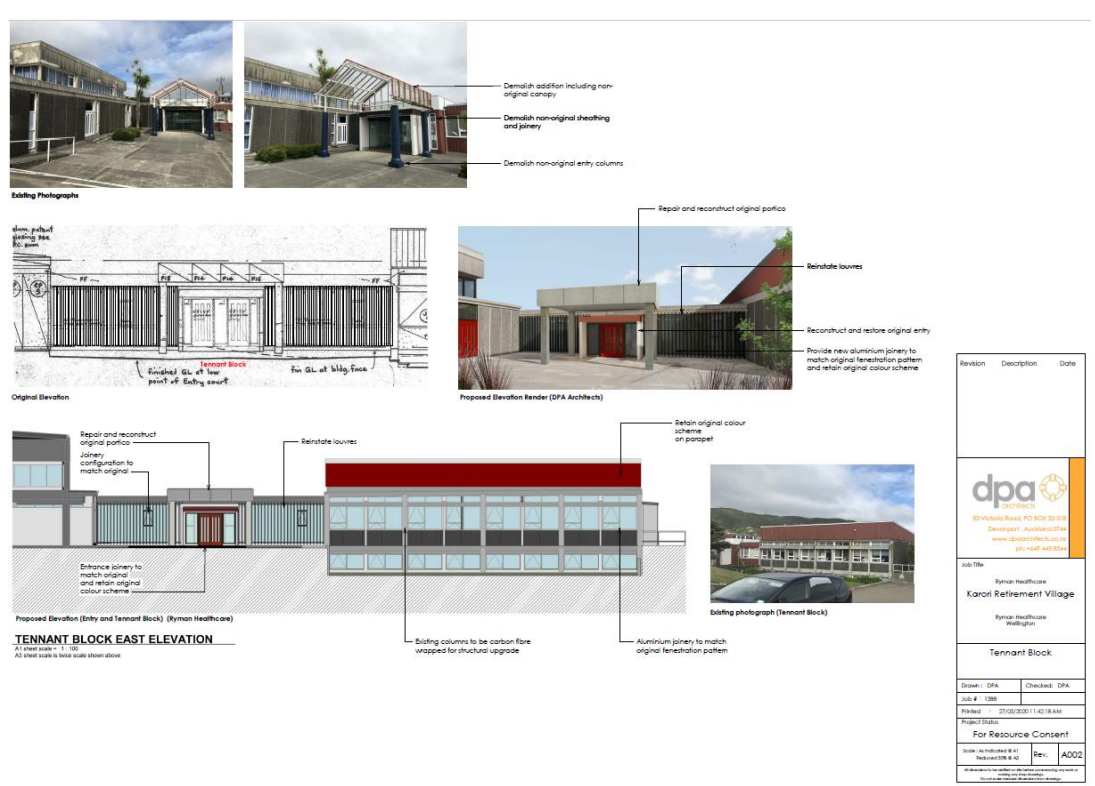
Image: Drawing A002 from page 26 of Appendix C: Heritage Technical Report – DPA Architects .

15.4. My concern is that application drawings RC09, R10, R11 & R12 differ from the heritage architect's design. These drawings include lines that could be interpreted as a fence or screen.