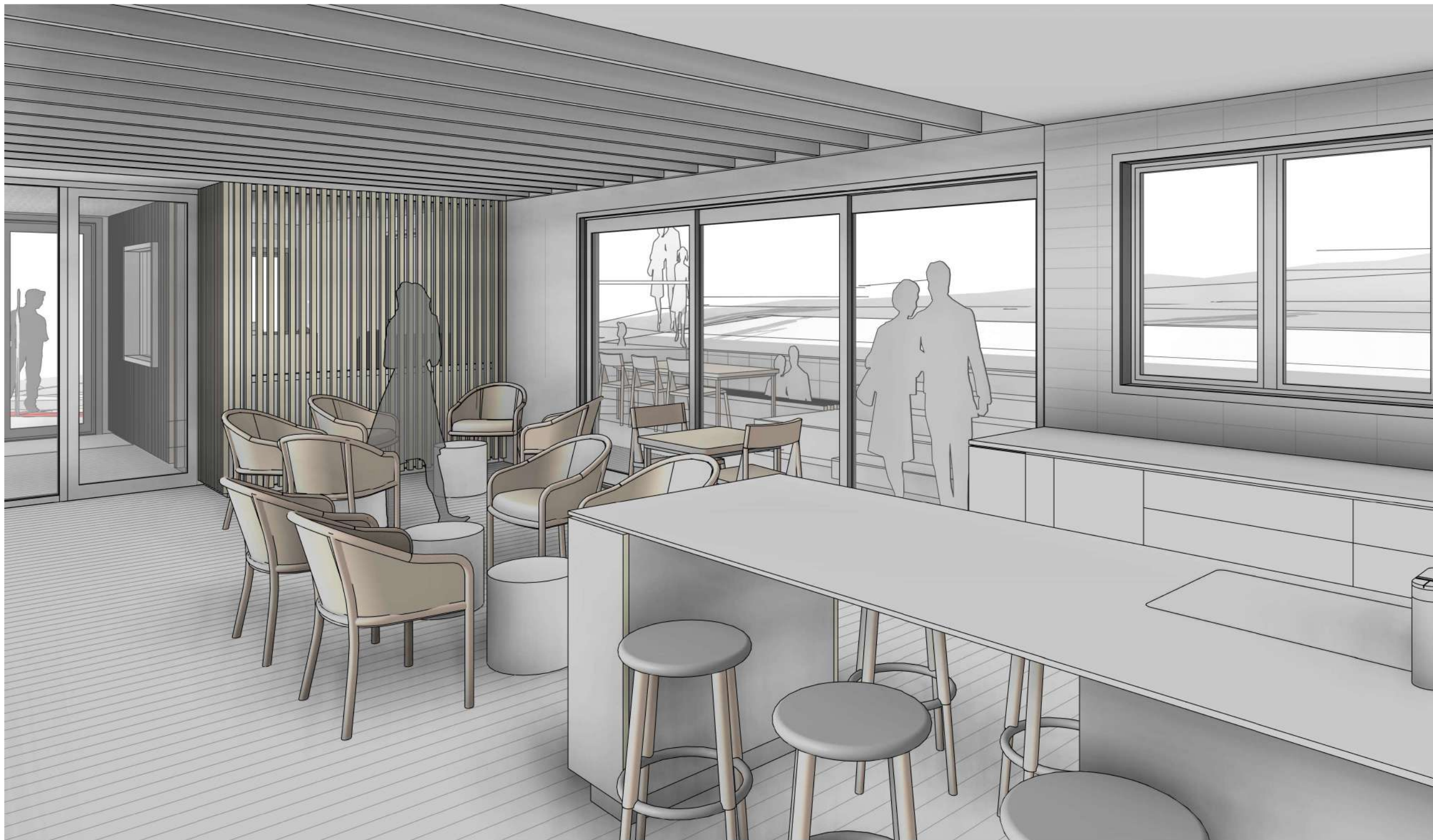
View from kitchen looking toward courtyard NOT TO SCALE