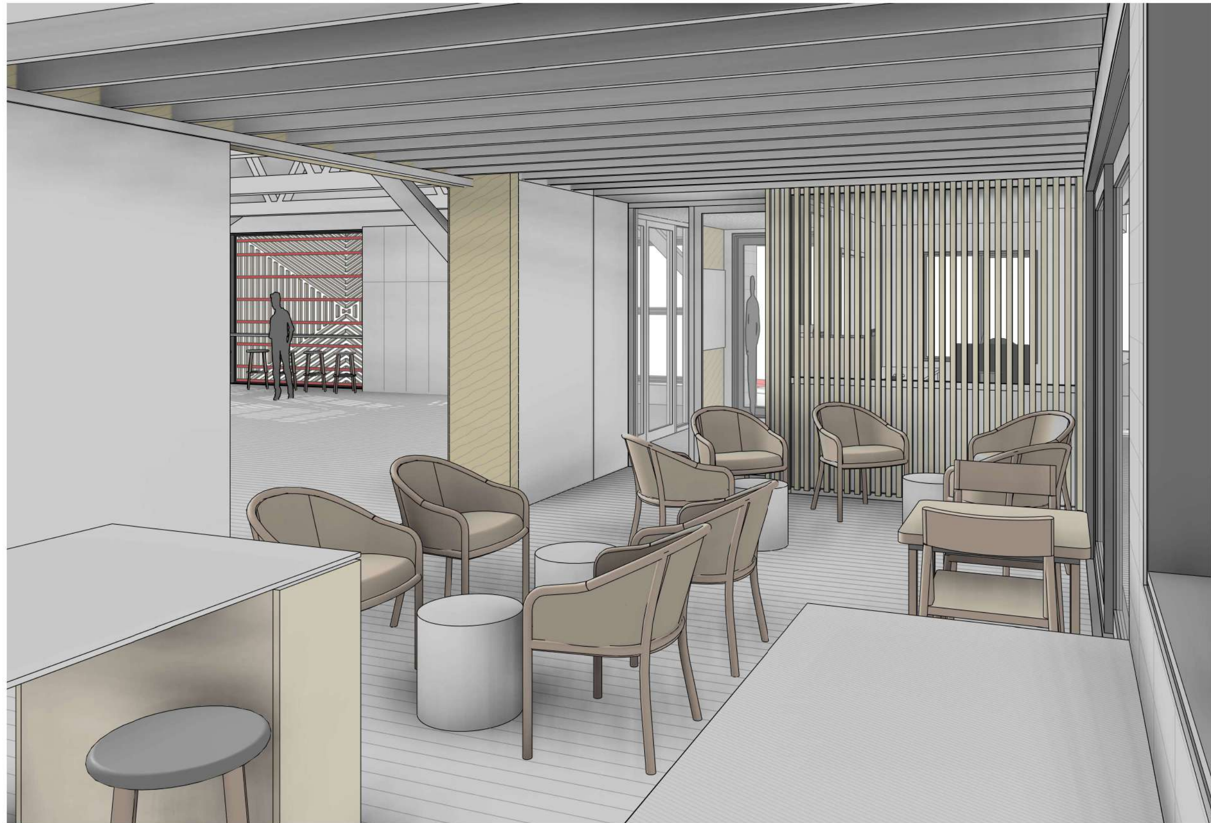
View from kitchen looking toward entry SCALE @ A3 -