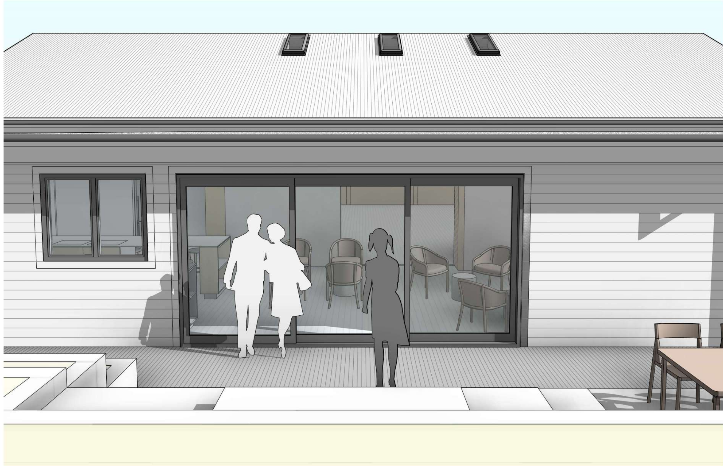
Landscaping - View of Courtyard from S NOT TO SCALE

STRATHMORE PARK COMMUNITY CENTRE UPGRADE