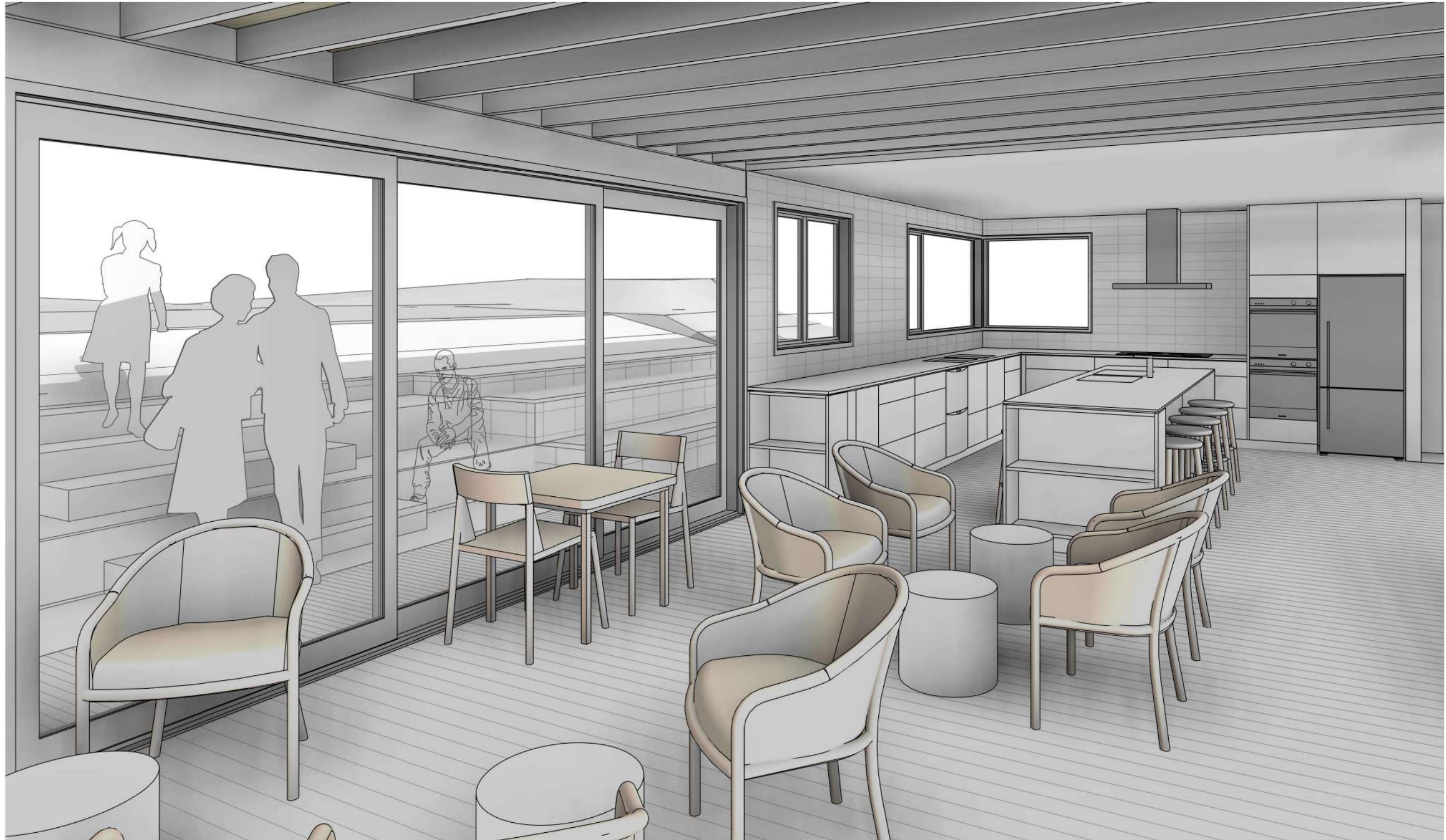
View from Raukawa Lounge from Entry NOT TO SCALE