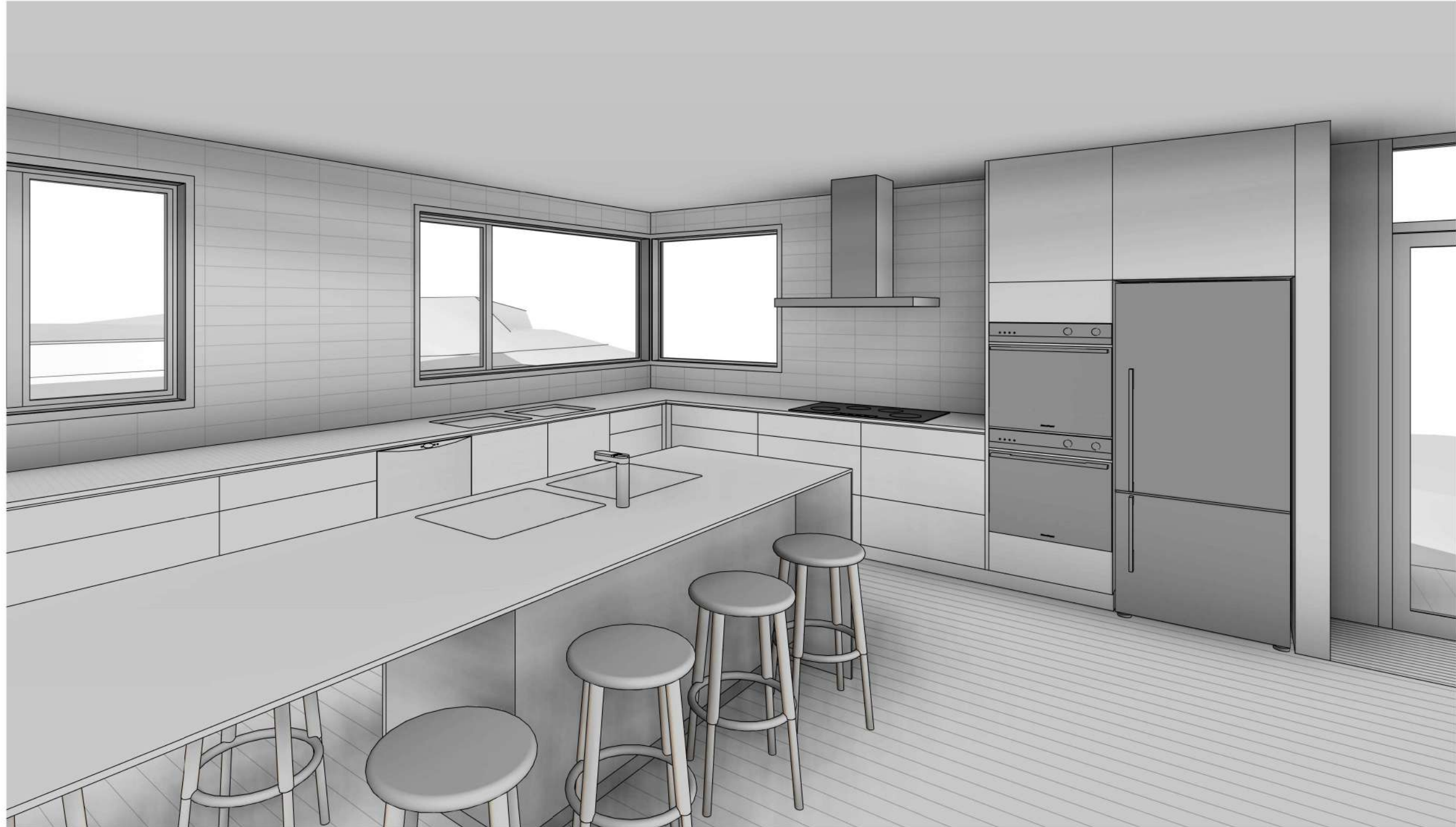
▶ Kitchen view NOT TO SCALE