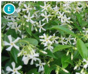
Trachelospermum jasminoides ( Star Jasmine ) Spacing: 500mm, Grade: 2L