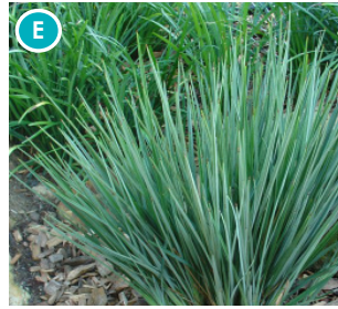
Tasmanian Flax-Lily ( Dianella 'Little Rev' ) Spacing: 500mm, Grade: 1L