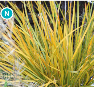
NZ Iris ( Libertia ixioides ) Spacing: 500mm, Grade: 2.5L