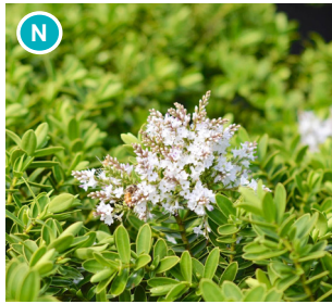
Hebe ( Hebe 'Wiri Mist' ) Spacing: 600mm, Grade: 2.5L