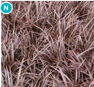
Dwarf flax ( Phormium 'Sweet Mist' ) Spacing: 500mm, Grade: 2.5L