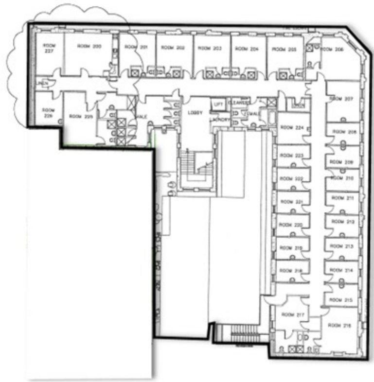
NEW SECOND FLOOR PLAN

Wellington City Council Received: 21/12/2023