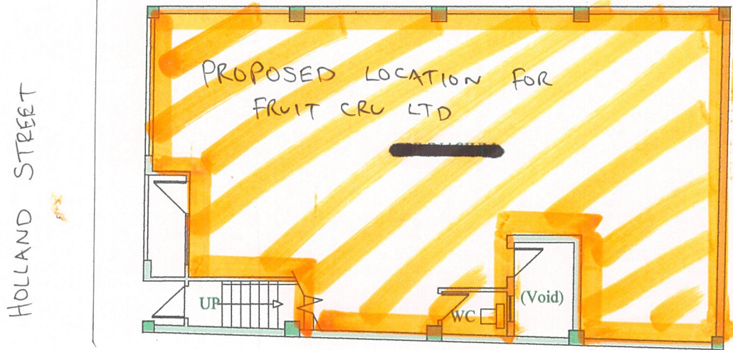
GROUND FLOOR PLAN (1:100)