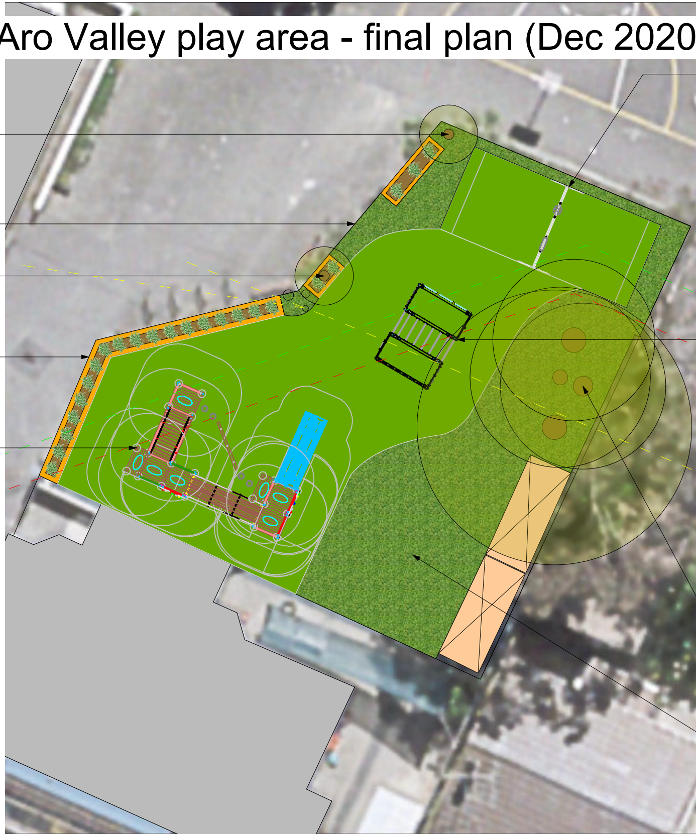
One-bay swing with toddler and single swing