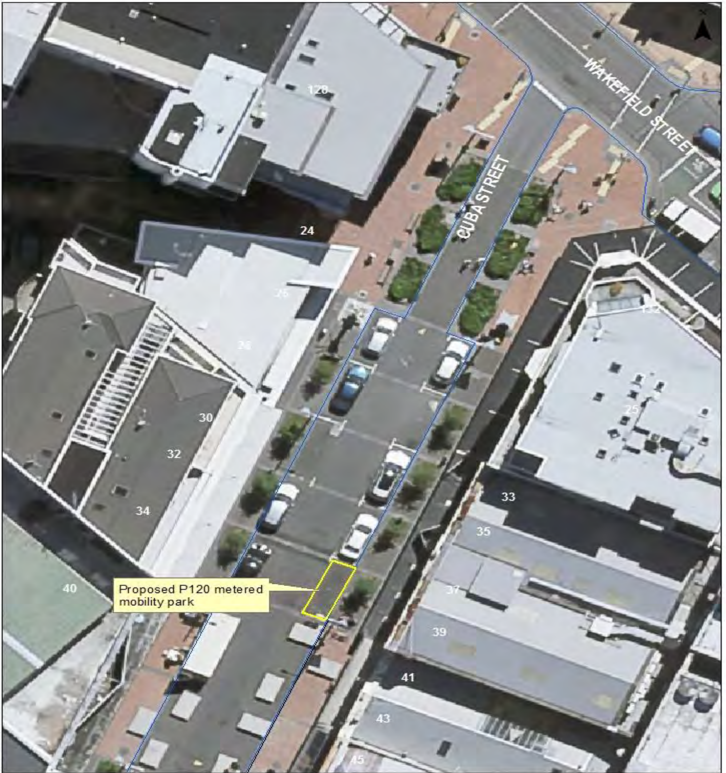
Cuba Street TR73-19 Proposed metered mobility park

Absolutely Positively Wellington City Council Me Heke Ki Pōneke