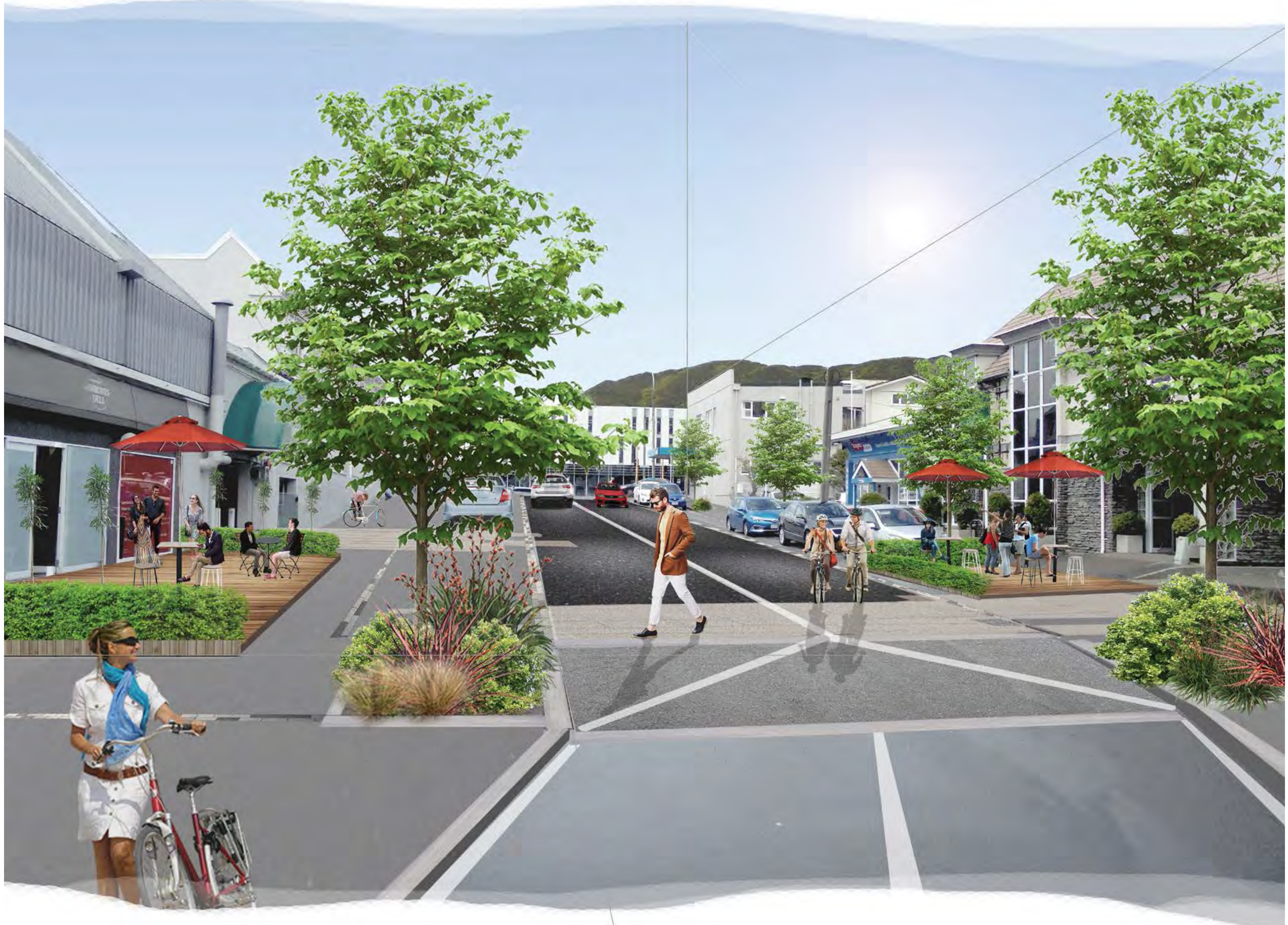
Artist impression: Option C - View up Parkvale Road to Karori Road